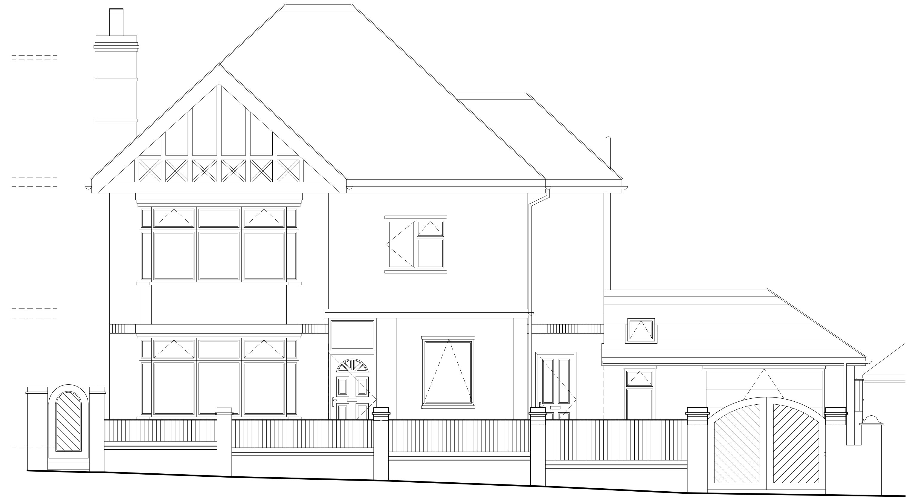
STREET VIEW BEECH AVENUE