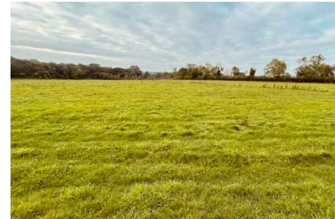
Existing view D