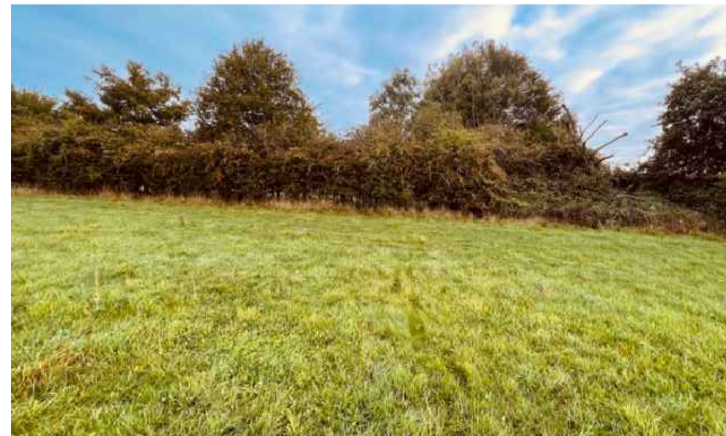
Existing view B