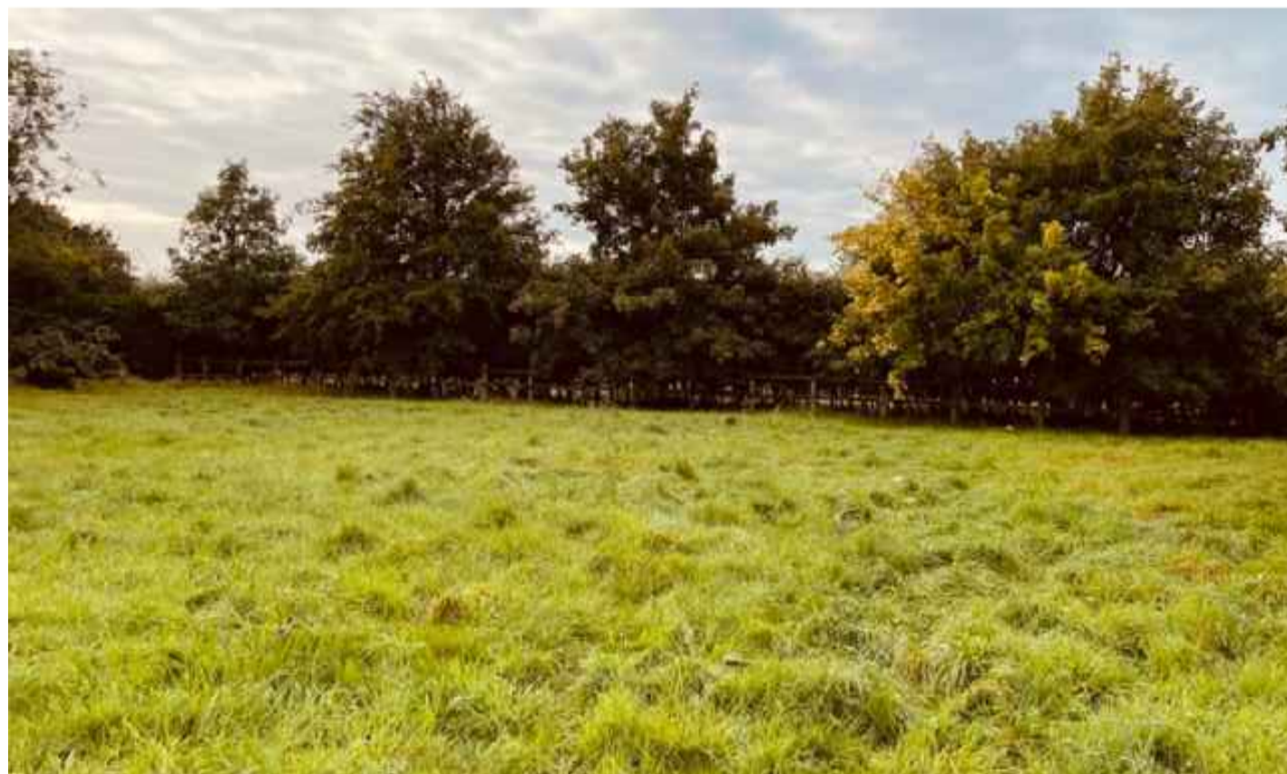
Existing view A