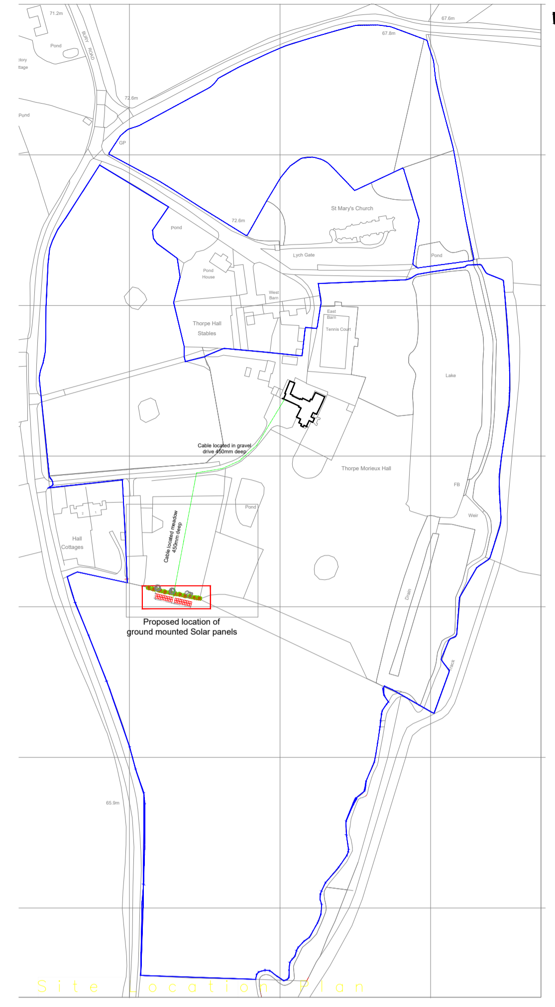
Location Plan 1:2500