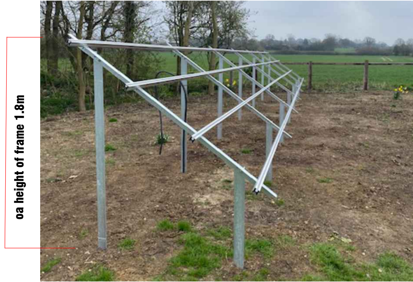
Photo height of frame 1.8m