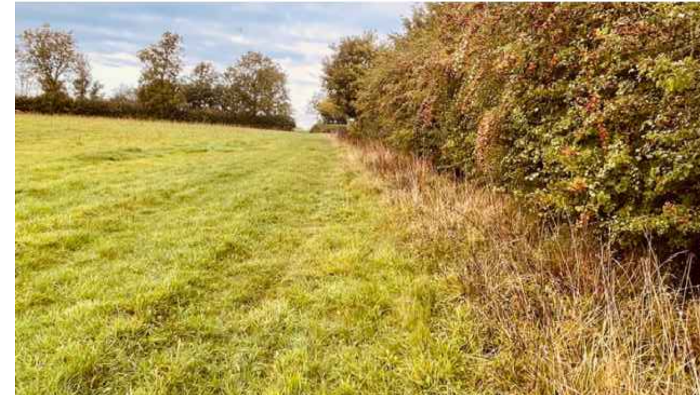
Existing view C

Installation of ground mounted Solar panels. Sited in existing meadow Location screened on boundaries by mature hedge rows . Panels fixed to metal frame with panels set at 30deg facing south in two arrays of 20 panels each Panel size 1.722 x 1.134 fixed portrait as photo . Panels screened from house by mature planting hedges and trees Distance of panels from house 155 m Solar Panels by JA solar JAM54S31 380-405/MR/1000V