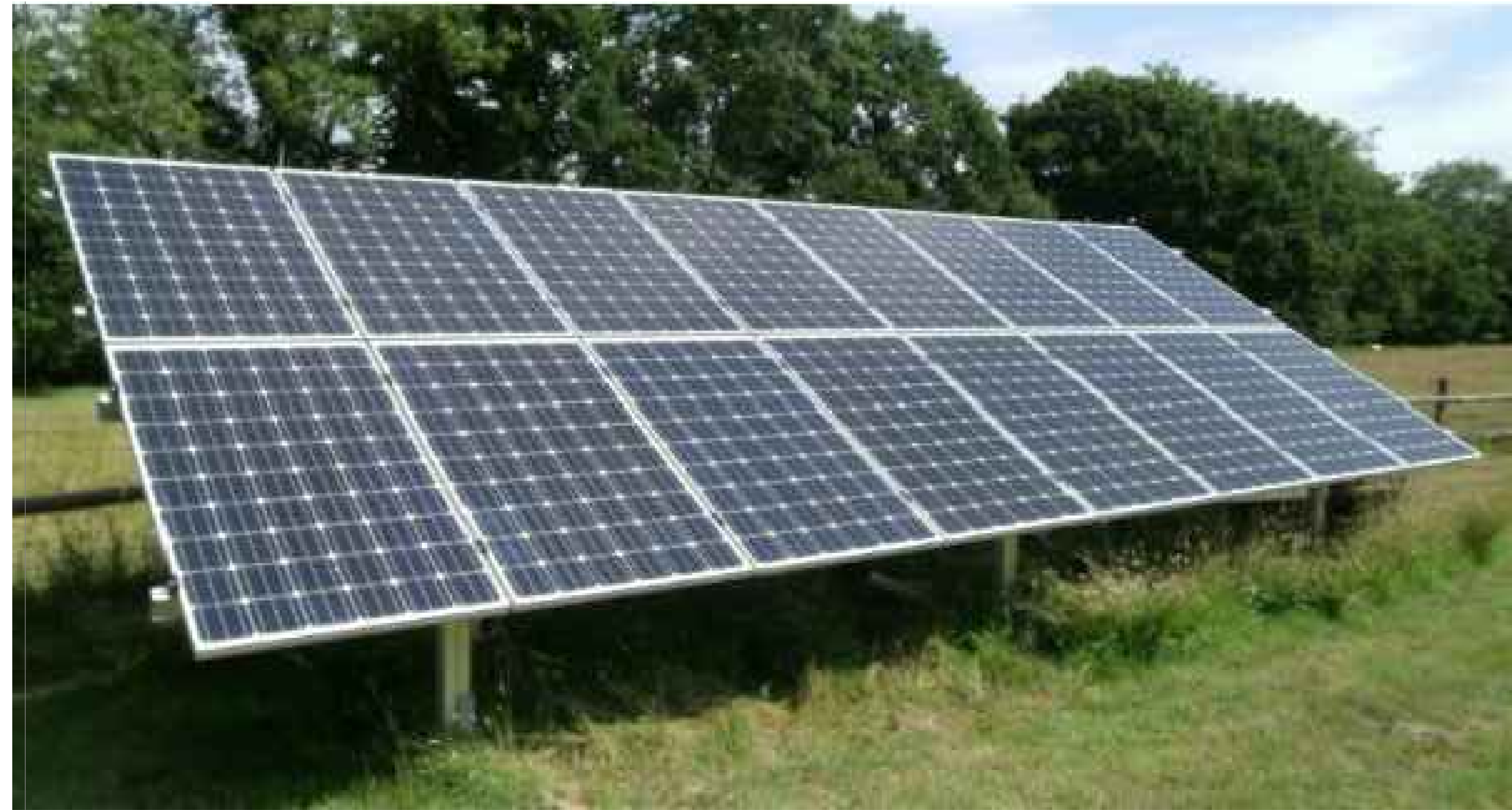
Photo of typical array

Installation of ground mounted Solar panels. Sited in existing meadow Location screened on boundaries by mature hedge rows . Panels fixed to metal frame with panels set at 30deg facing south in two arrays of 20 panels each Panel size 1.722 x 1.134 fixed portrait as photo . Panels screened from house by mature planting hedges and trees Distance of panels from house 155 m Solar Panels by JA solar JAM54S31 380-405/MR/1000V