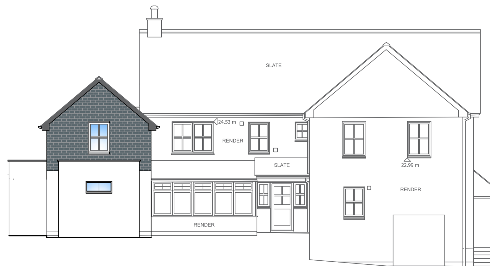
EAST ELEVATION AS PROPOSED 1:100