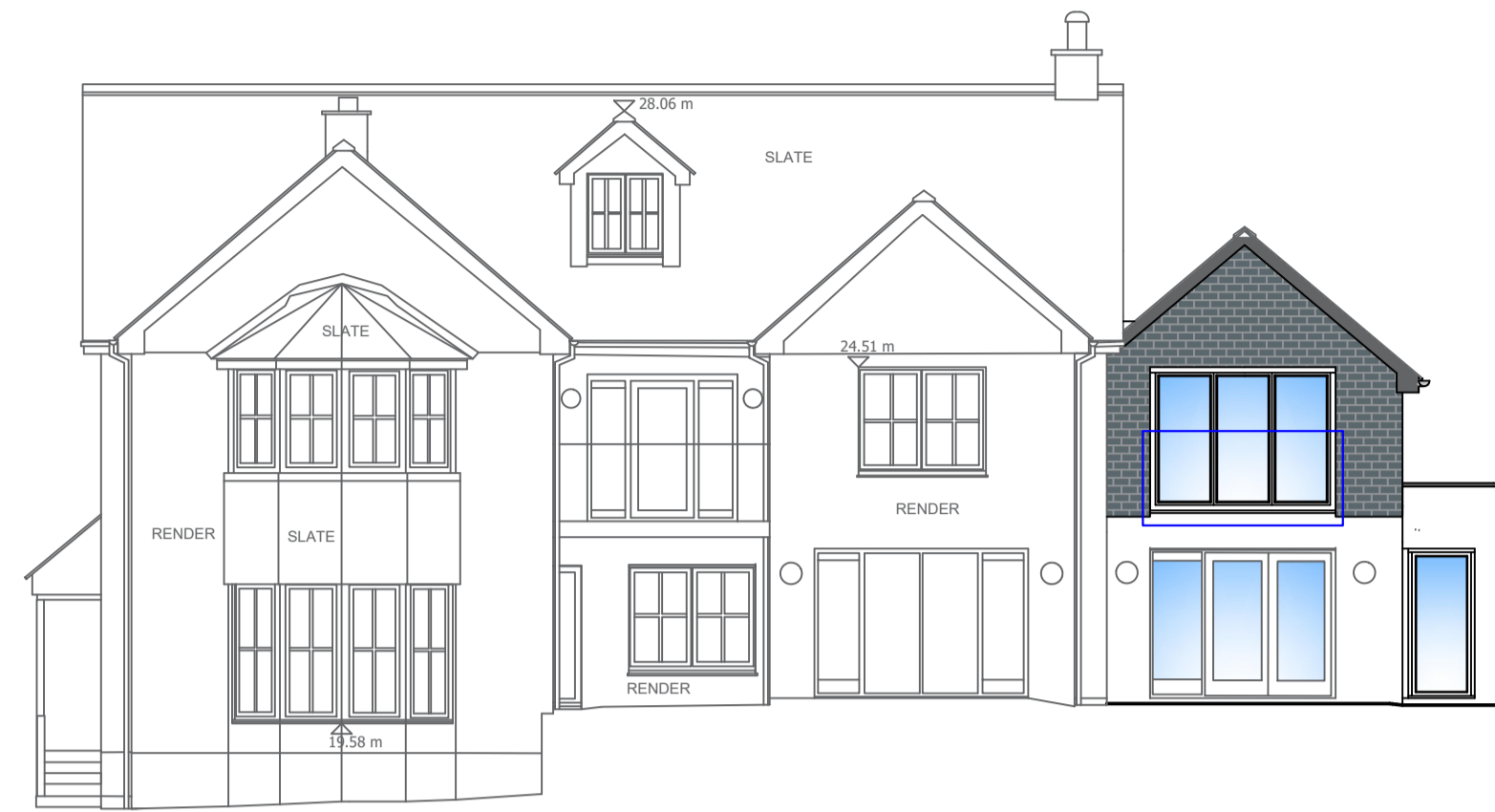
WEST ELEVATION AS PROPOSED 1:100