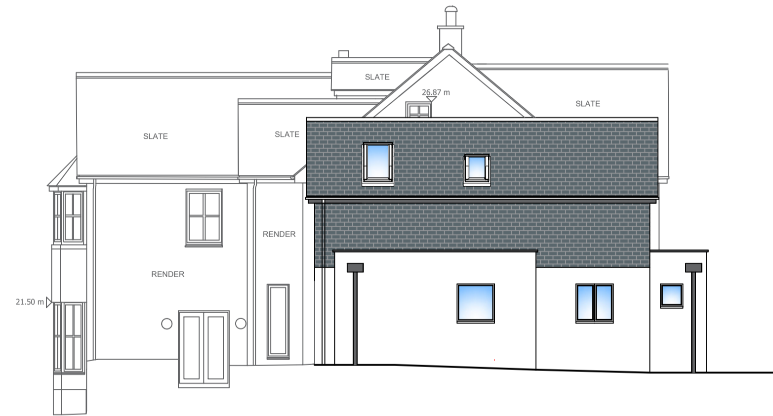
SOUTH ELEVATION AS PROPOSED 1:100