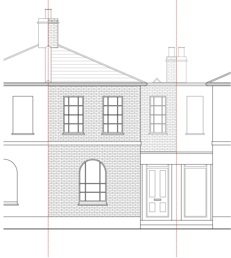
1 Proposed South Elevation (Front) P_00_10