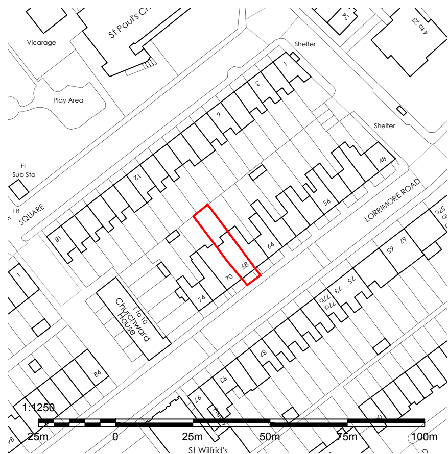
1 Location Plan X_00_01