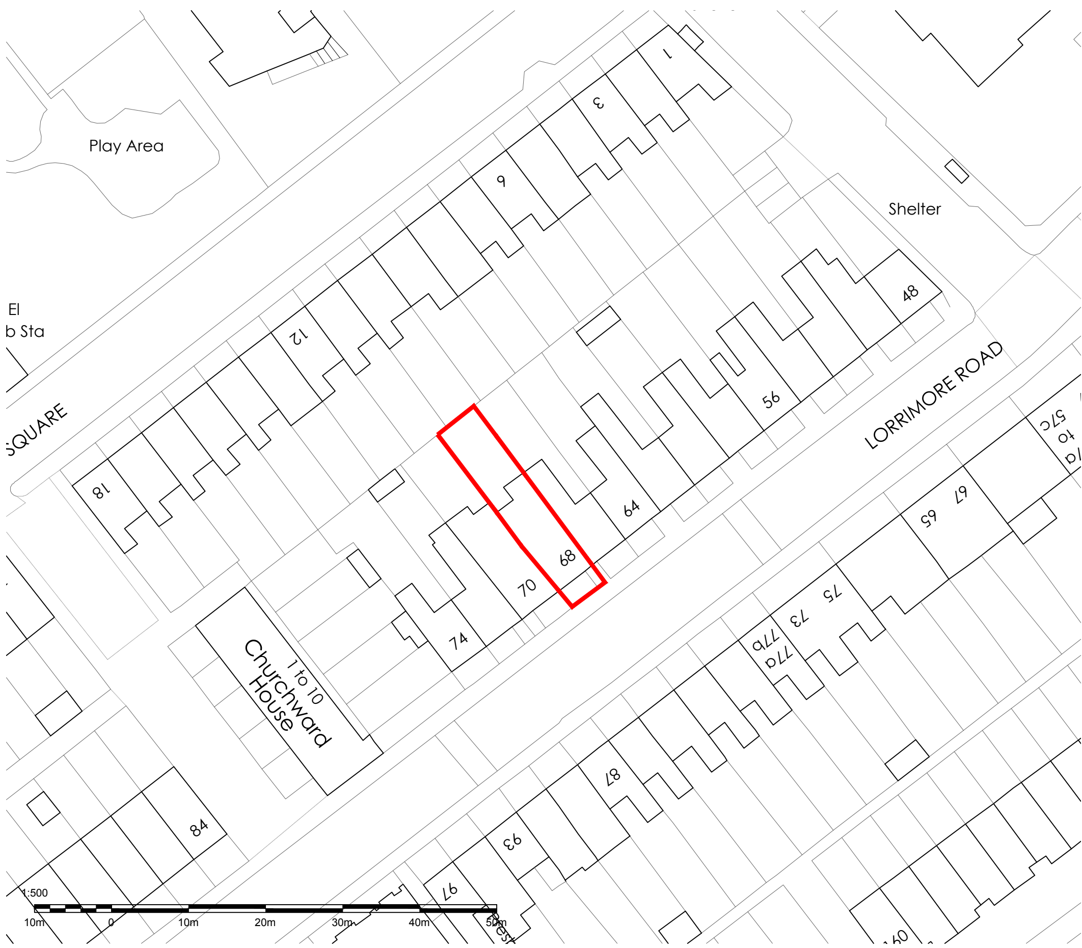
2 Site Plan X_00_01