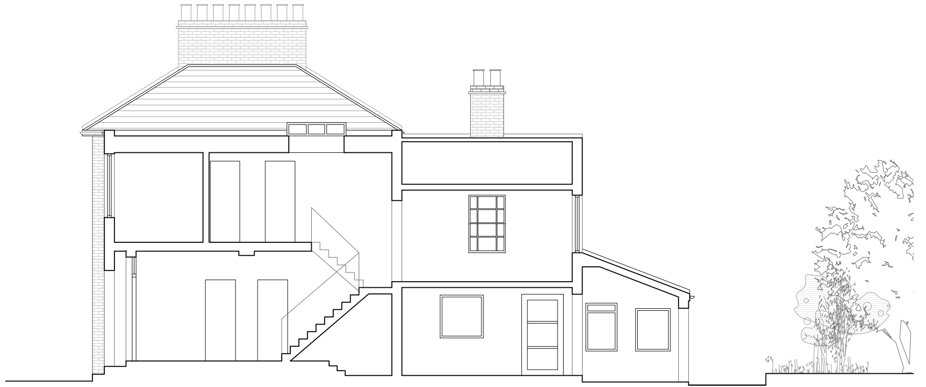
2 Existing Section BB X_00_20