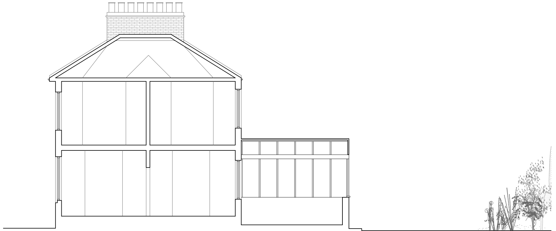
3 Existing Section CC X_00_20