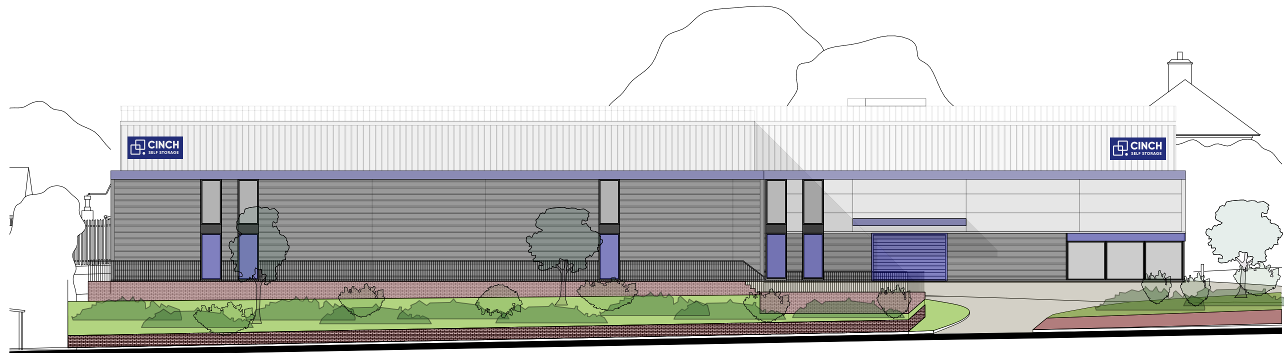
02 Proposed East Elevation 17 1:200@A3; 1:100@A1