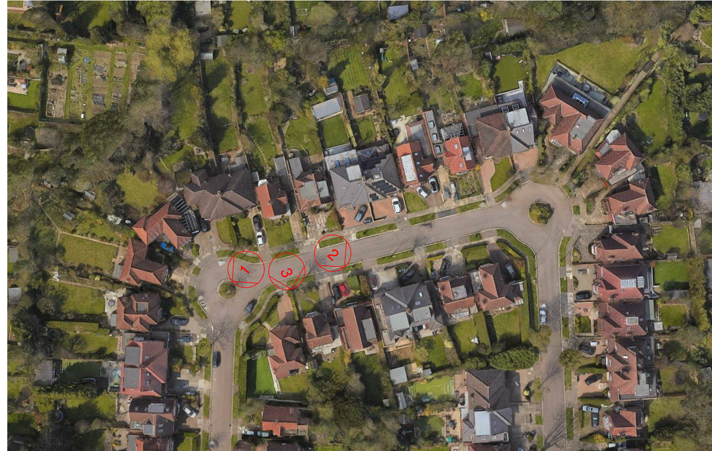
Site Plan View