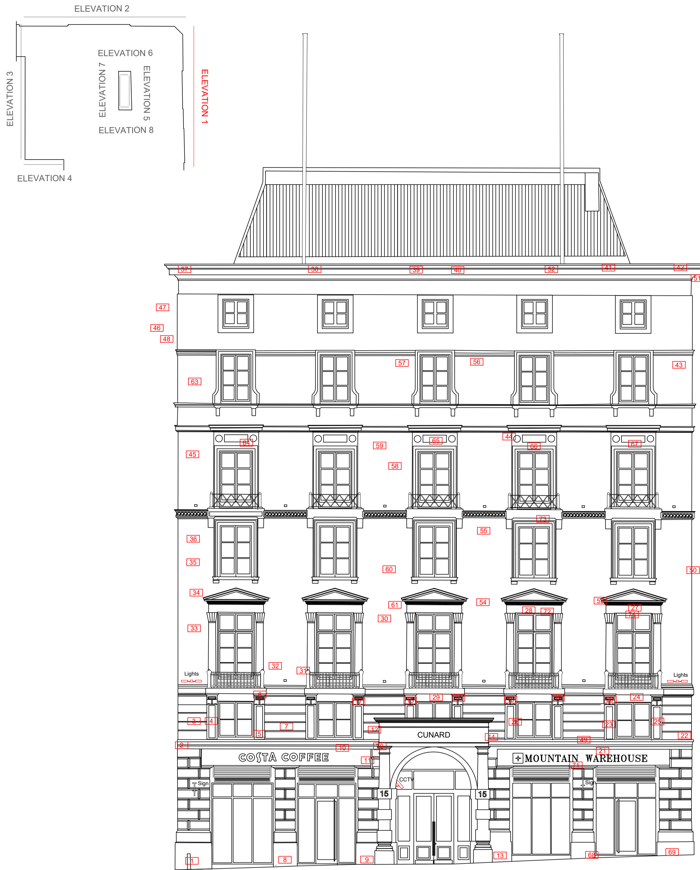
Regent Street Elevation