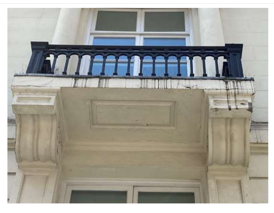
Photo 10: Splits / cracks to decoration to front elevation. Paint runs visible.