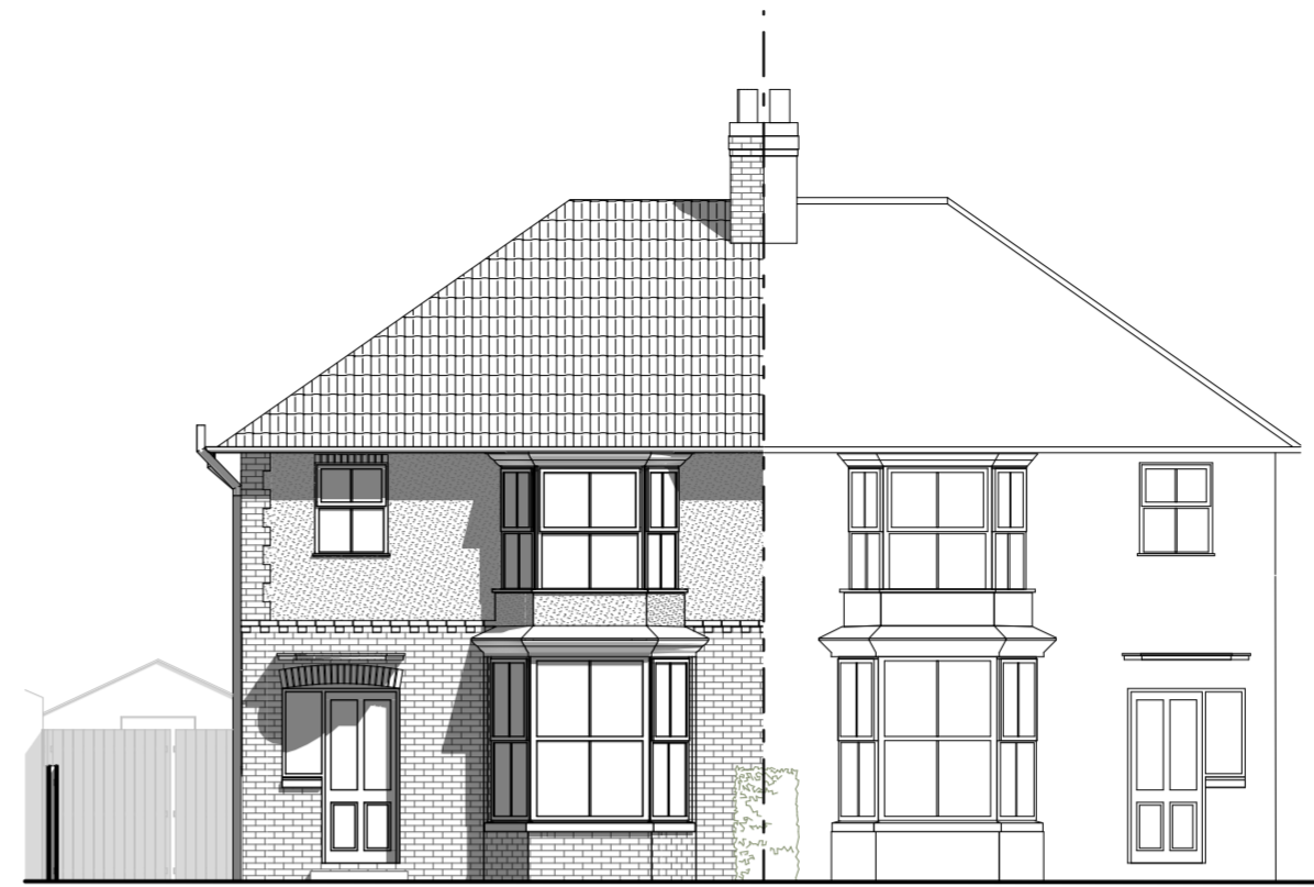
02 | NORTH FACING FRONT ELEVATION AS EXISTING SCALE 1:100