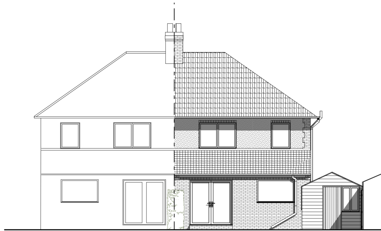
01 | SOUTH FACING REAR ELEVATION AS EXISTING SCALE 1:100