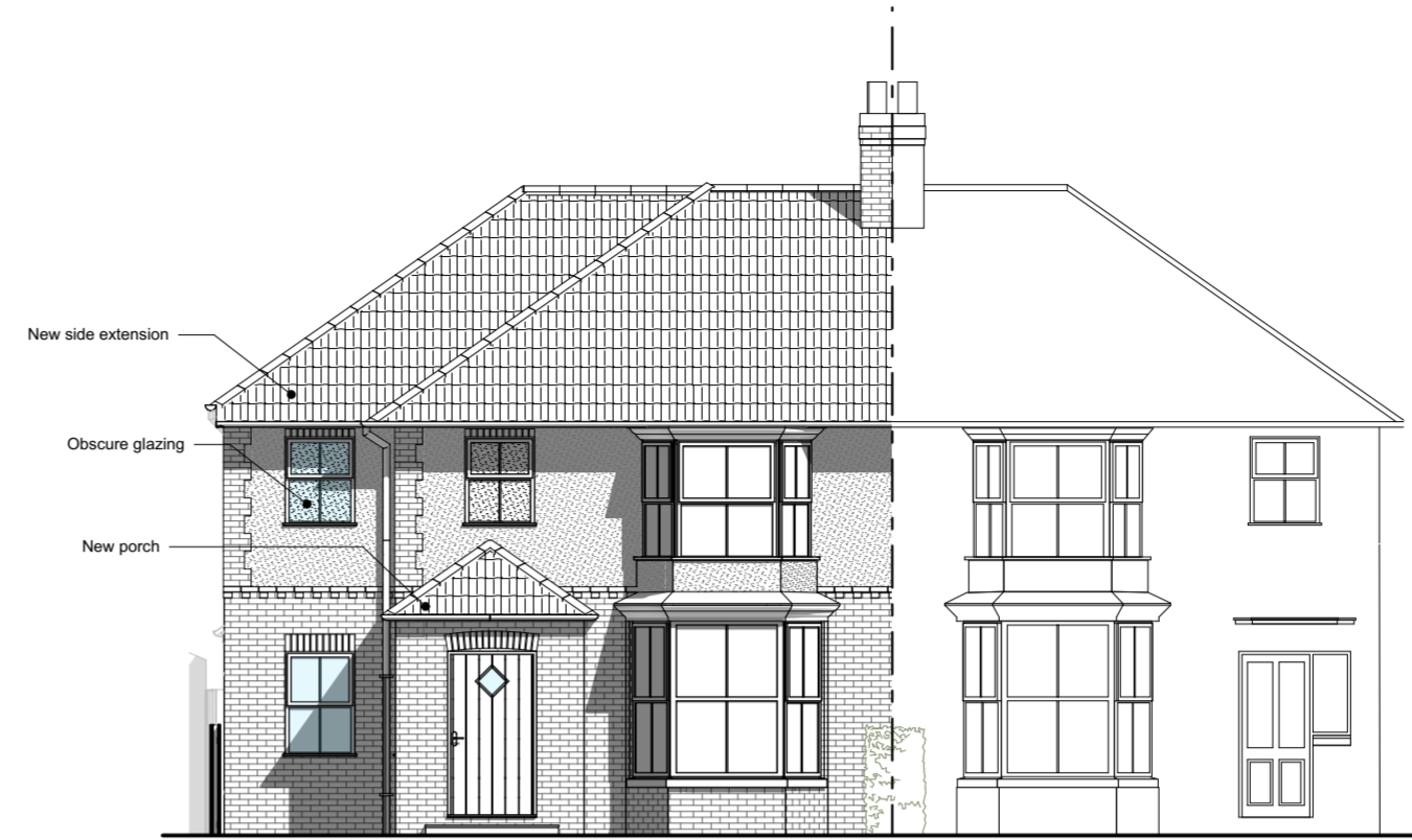
02 | NORTH FACING FRONT ELEVATION AS PROPOSED SCALE 1:100