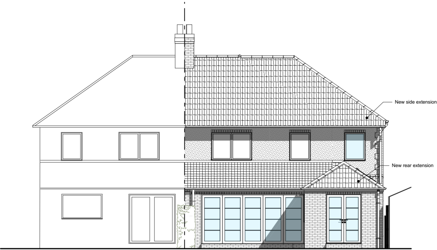
01 | SOUTH FACING REAR ELEVATION AS PROPOSED SCALE 1:100