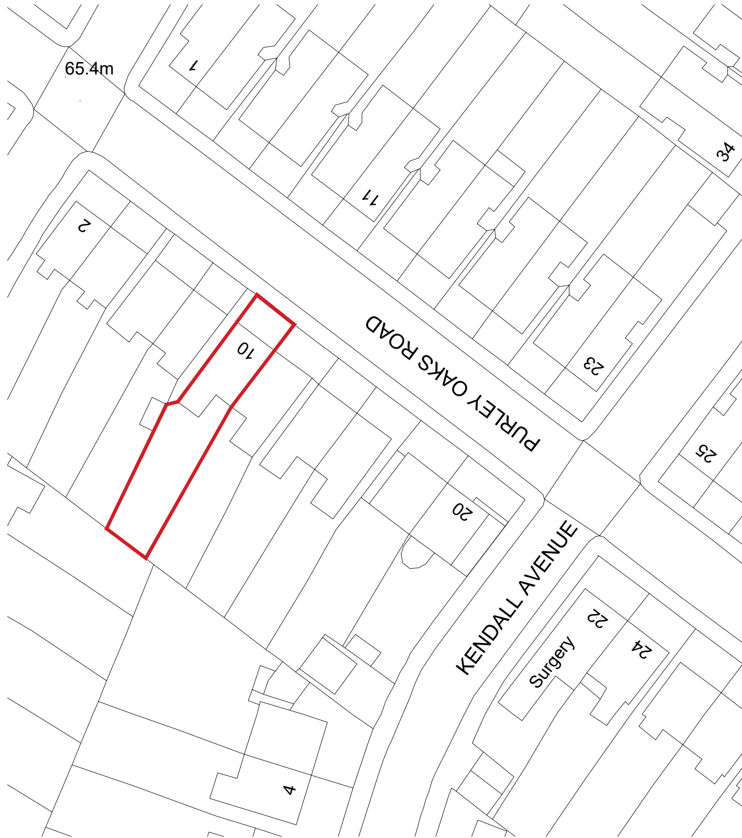
SCALE 1:500 @ A3