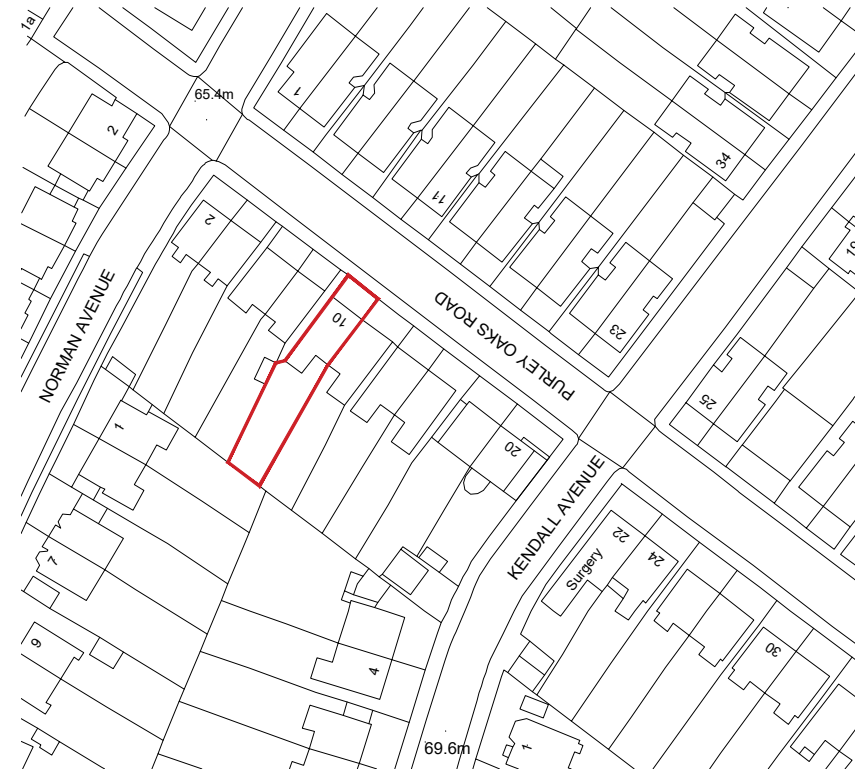
SCALE 1:1250 @ A3