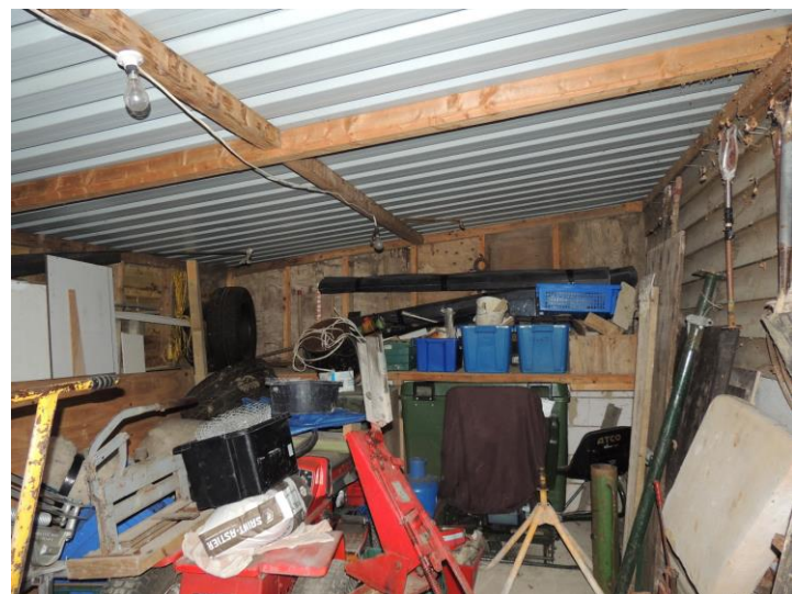
Photo 8: The interior had no features that might be occupied by bats