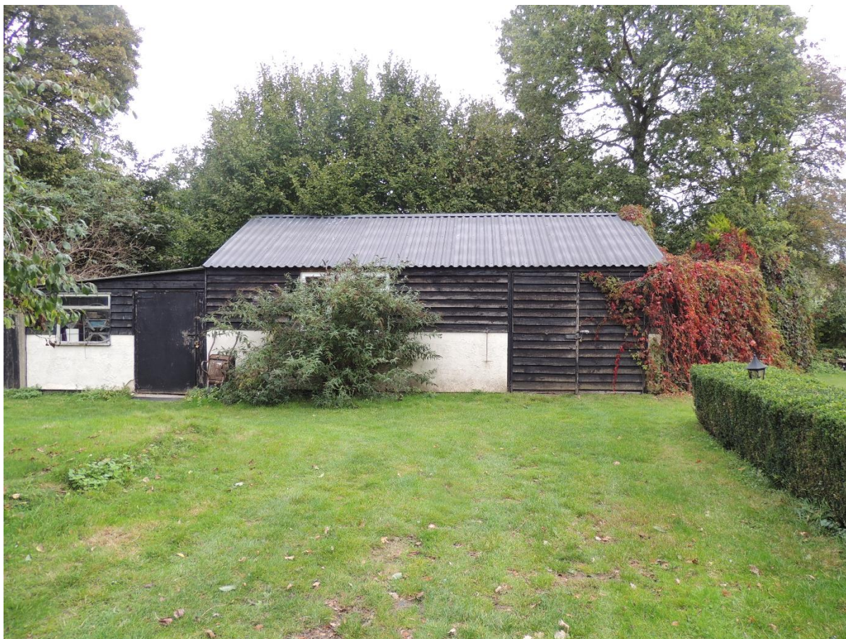
Photo 1: Southern elevation of the shed. The proposal is to demolish this building and site new dwellings on the lawn to the south

As part of a planning proposal involving three outbuildings at North Banks, Standon Road, Little Hadham, Ware, Hertfordshire SG11 2DE, a site visit was conducted on 6 th October 2023 to determine whether the buildings had the potential to be occupied by bats, which would be affected if any proposed development were to go ahead.