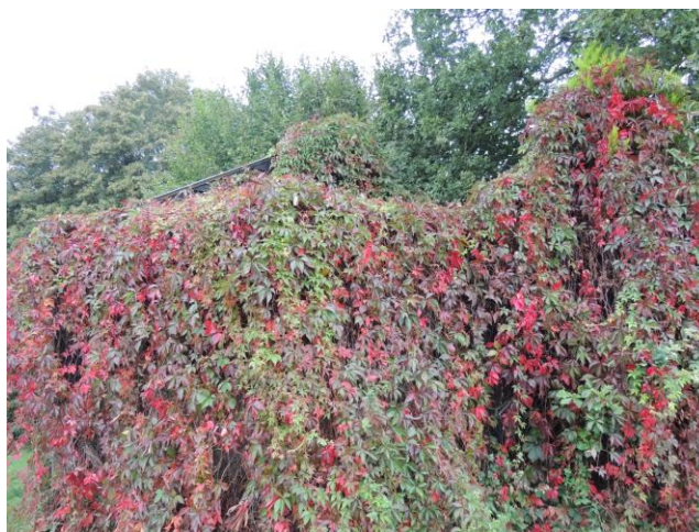
Photo 2: The eastern and northern elevations of the shed are engulfed by Virginia Creeper

The survey buildings comprise a shed (see Photo 1), a workshop and an annexe. The shed is due for demolition whereas the other buildings are to be retained and are unaffected by the proposal. The shed is aligned E-W and has a metal sheet roof and weather-boarded walls above a block plinth. The western wall of a lean-to store with a sloping metal sheet roof is of block. The survey found that the interior of the building received daylight illumination via a window to the south, and the lean-to shed was lit by windows to the south and west. In such conditions, bats seek out dark areas or crevices in which to roost and the lack of such features in the walls and roof meant that the building was unsuitable as a roosting place for bats. The workshop had a slate and felted roof and weather-boarded walls. The roof area was accessed via a ladder and no evidence of bats was found in the loft or on items stored within the roof void. The annexe has a slate roof and pale, rendered walls. The interior has a vaulted ceiling throughout and is for residential use. Externally, there was a tight seal to the eaves and gables and no evidence such as droppings or staining was found on the pale walls where the presence of bats would have been readily apparent.