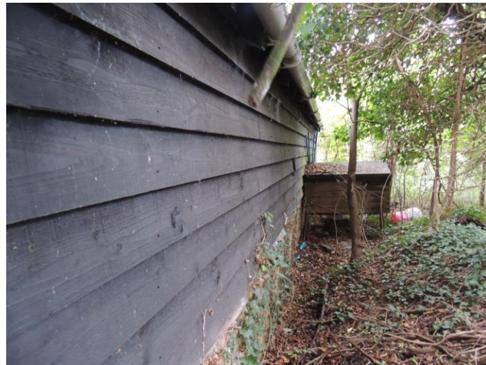
Photo 11: The northern elevation of the workshop is obscured by vegetation. Note tight seal to cladding