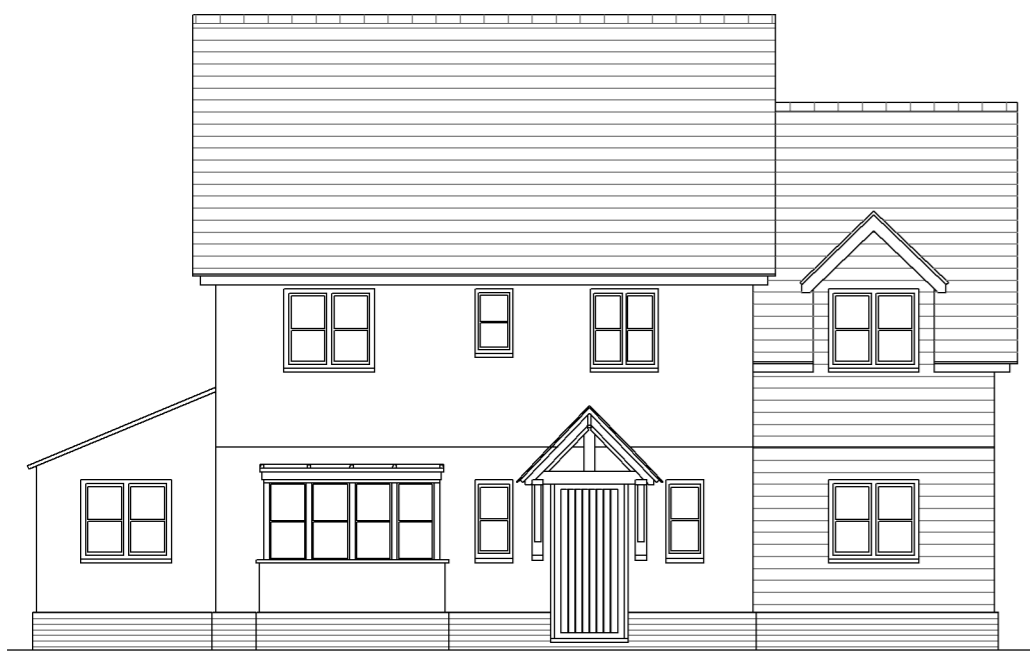
Front Elevation 0 1 2 3 4 5m Scale Bar