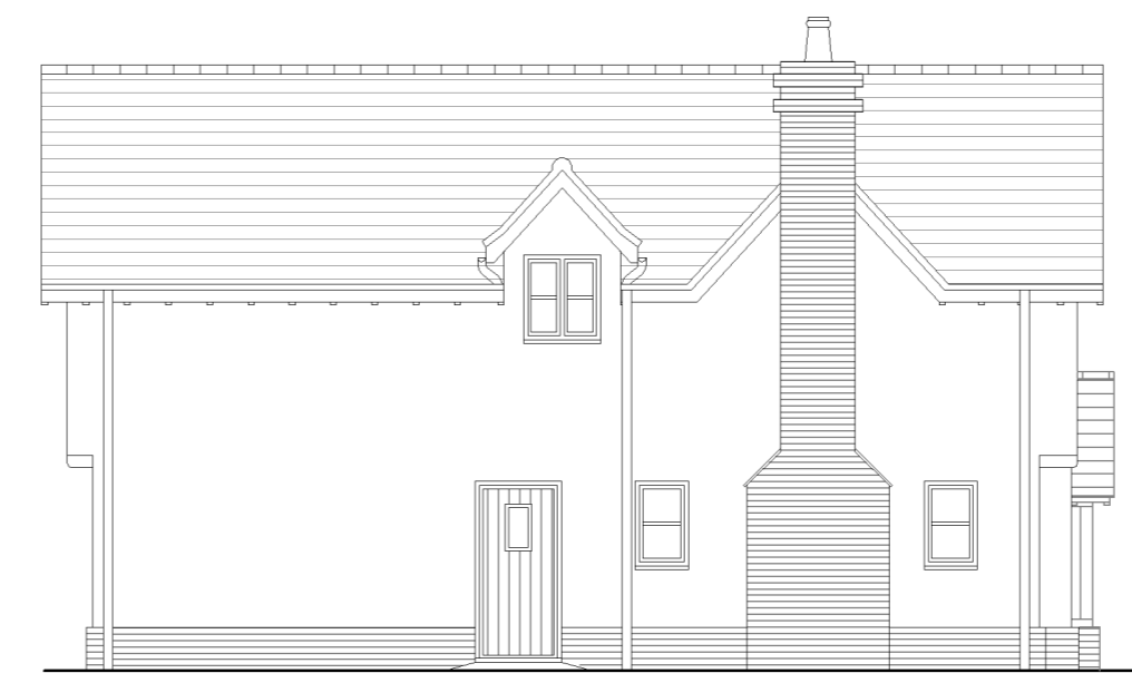
Ground Floor 0 1 2 3 4 5m Scale Bar