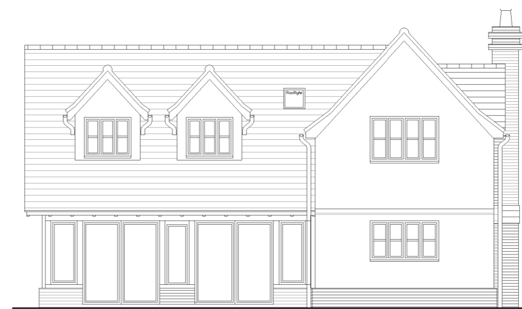
Front Elevation 0 1 2 3 4 5m Scale Bar