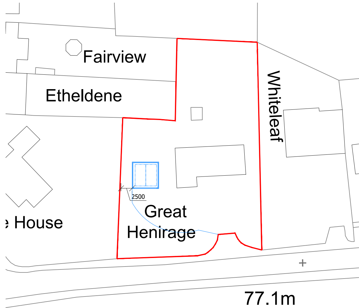
PROPOSED BLOCK PLAN 1.500