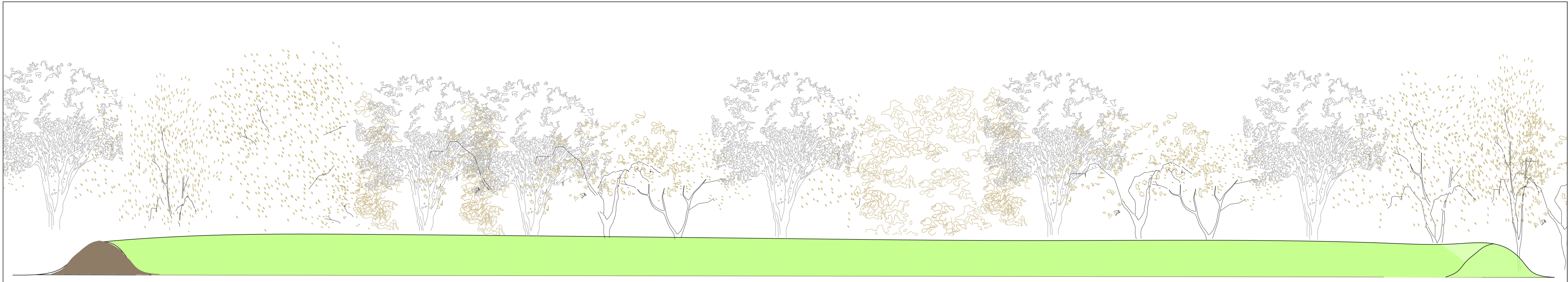
ELEVATION 1 - NORTH