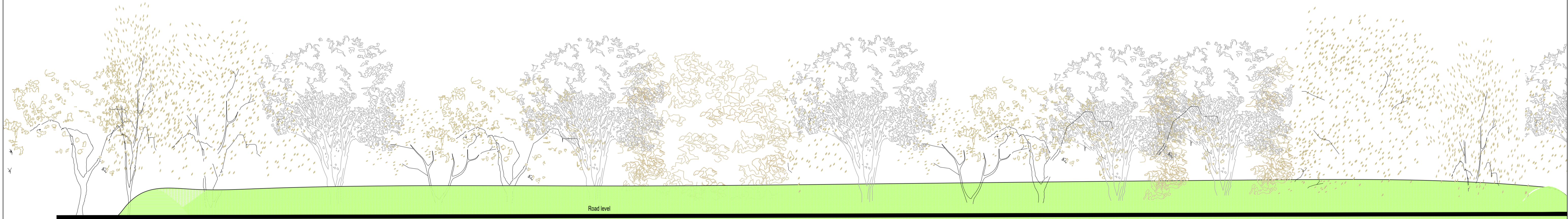
ELEVATION 2 - SOUTH