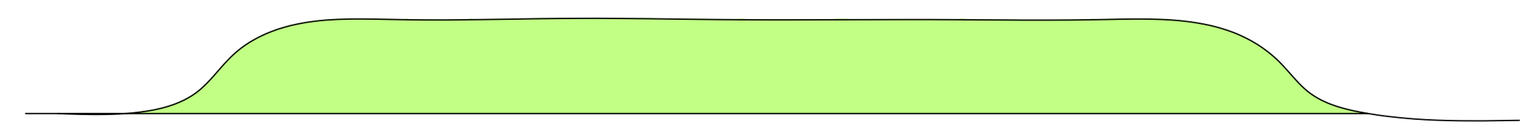
ELEVATION 3 - EAST