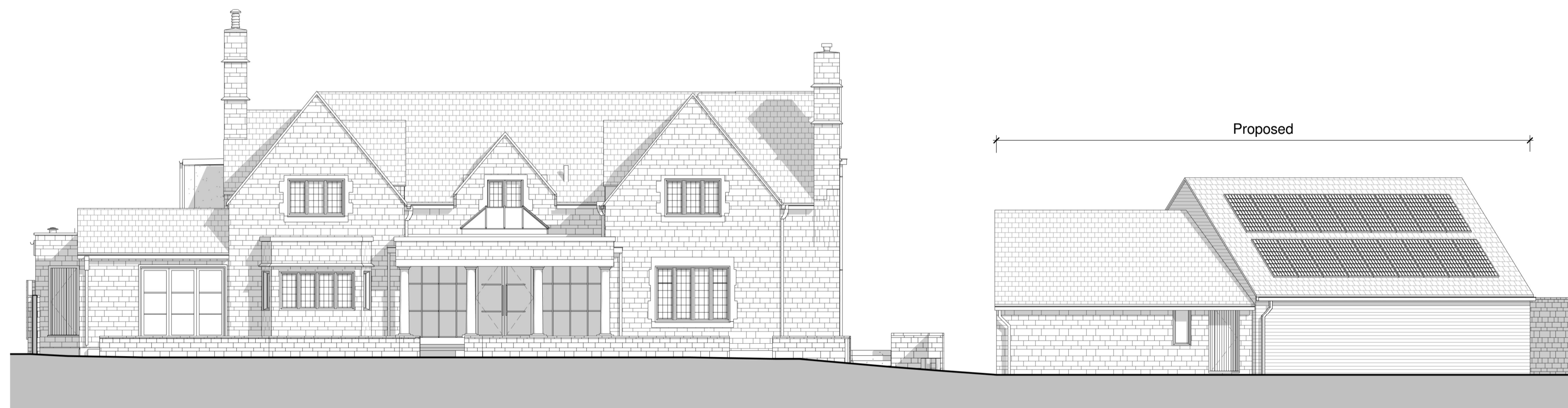
Proposed rear elevation - incorporating approved work to house ref. 23/01677/FUL 1 : 100