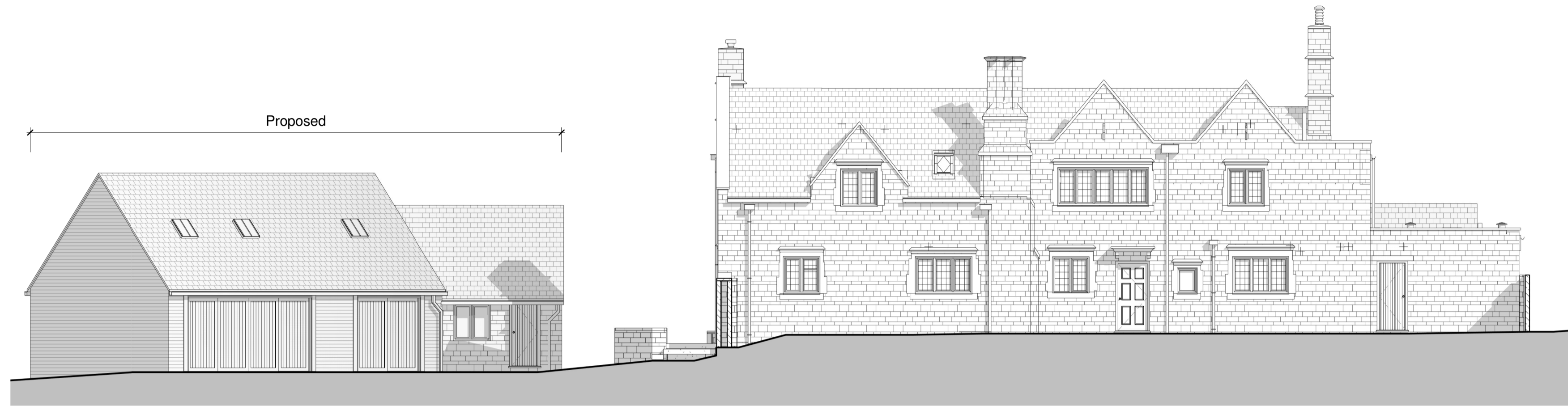
Proposed front elevation - incorporating approved work to house ref. 23/01677/FUL 1 : 100

Written dimensions to take precedence over scaled dimensions. All dimensions and levels to be checked on site and any discrepancies to be reported back to Contract Administrator before work commences.