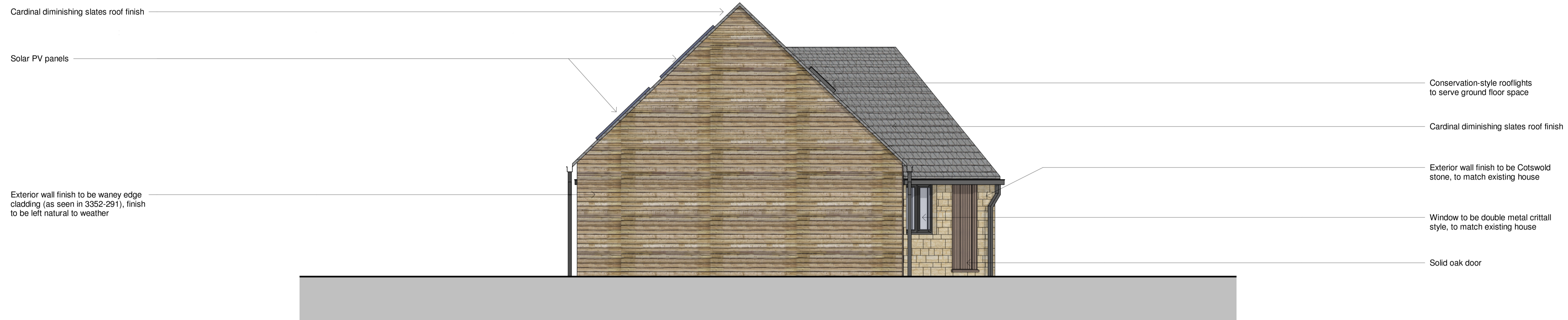
Proposed South elevation 1 : 50

Written dimensions to take precedence over scaled dimensions. All dimensions and levels to be checked on site and any discrepancies to be reported back to Contract Administrator before work commences.