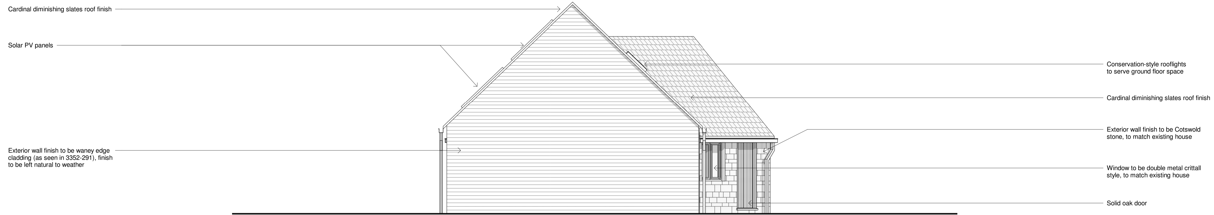
Proposed South elevation 1 : 50

Written dimensions to take precedence over scaled dimensions. All dimensions and levels to be checked on site and any discrepancies to be reported back to Contract Administrator before work commences.