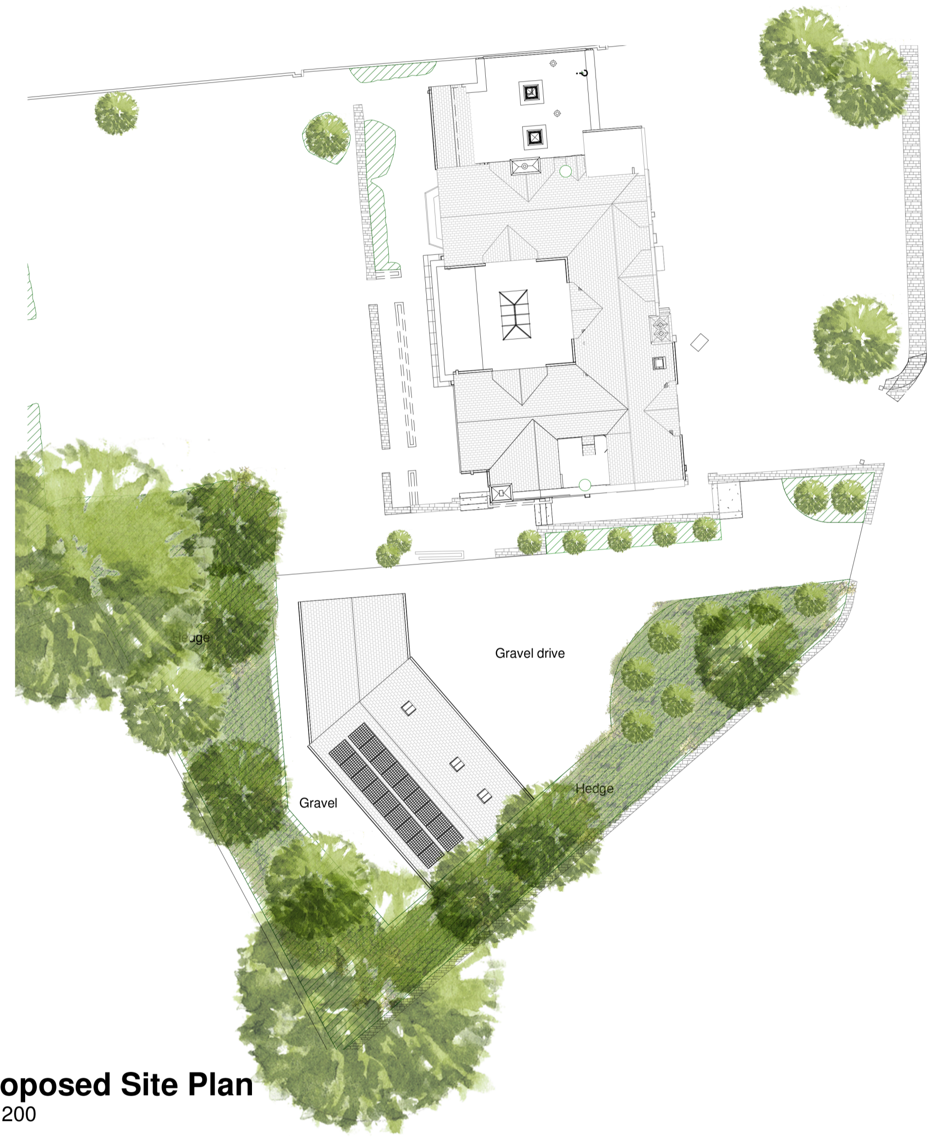
Proposed Site Plan 1 : 200