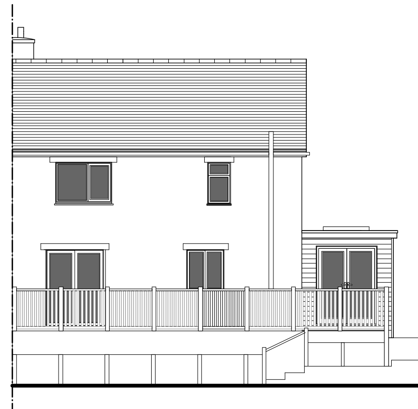
3 PROPOSED REAR ELEVATION 03 SCALE 1:50 @A2