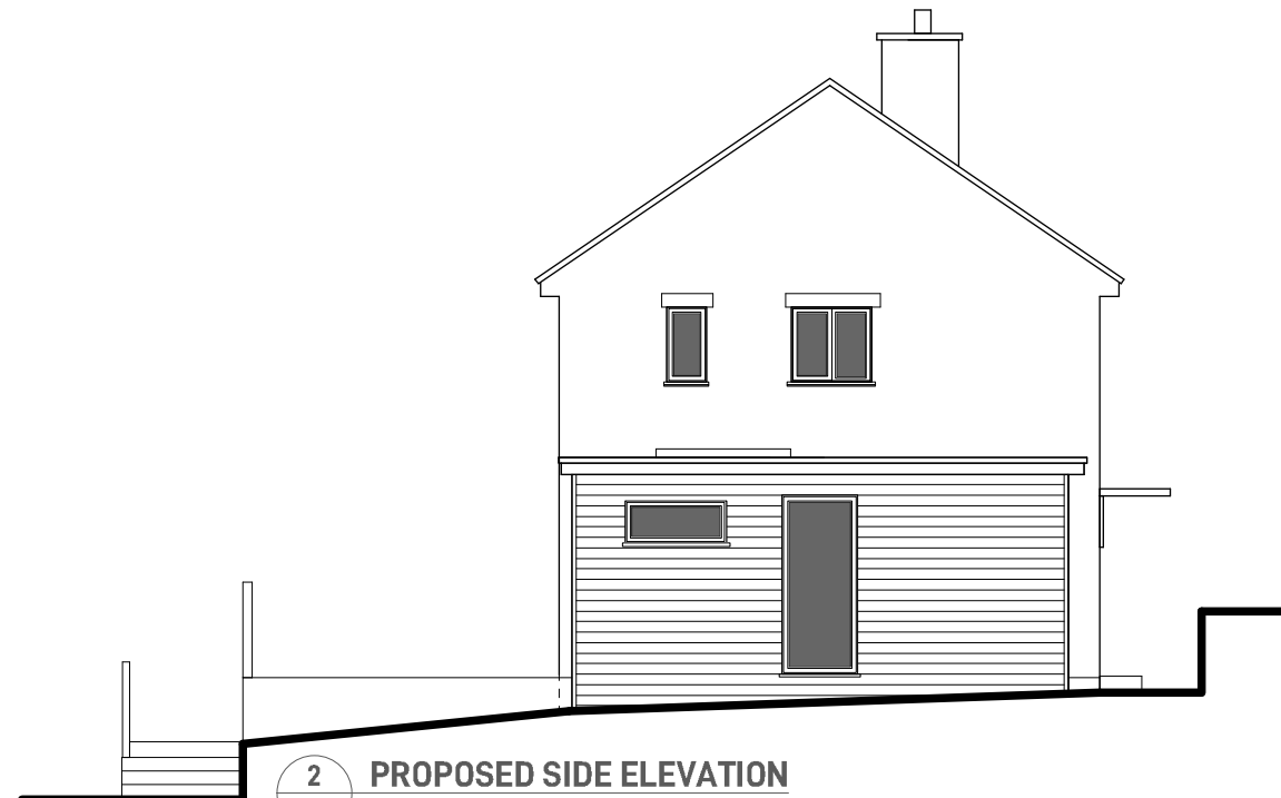
2 PROPOSED SIDE ELEVATION 03 SCALE 1:50 @A2