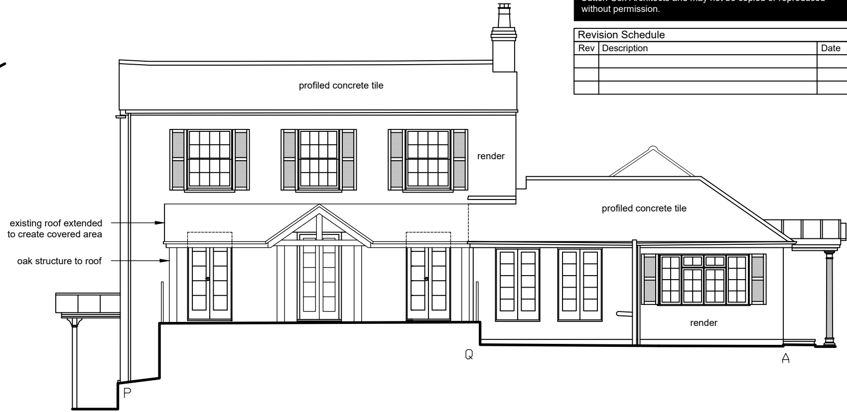
THE OLD PASSAGE SIDE/NORTH-WEST ELEVATION