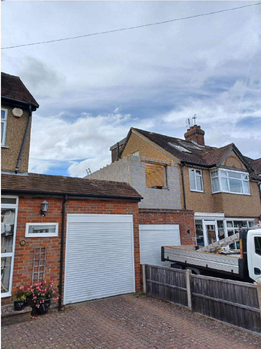
Photo indicating that the previously approved scheme is now upto plate height