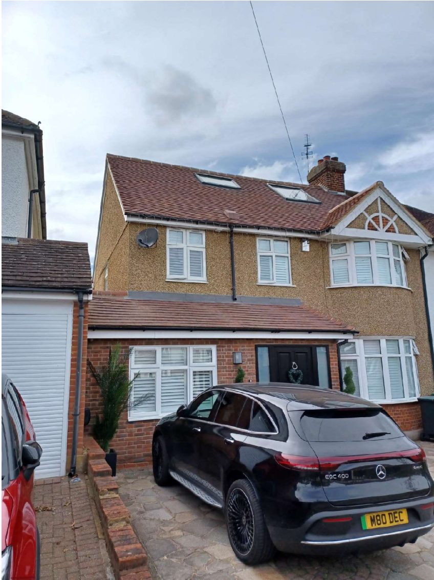
Number 19 Durrants Drive. Our proposals essential match this is appearance, massing, gable wall and extended rooflight at second floor level.