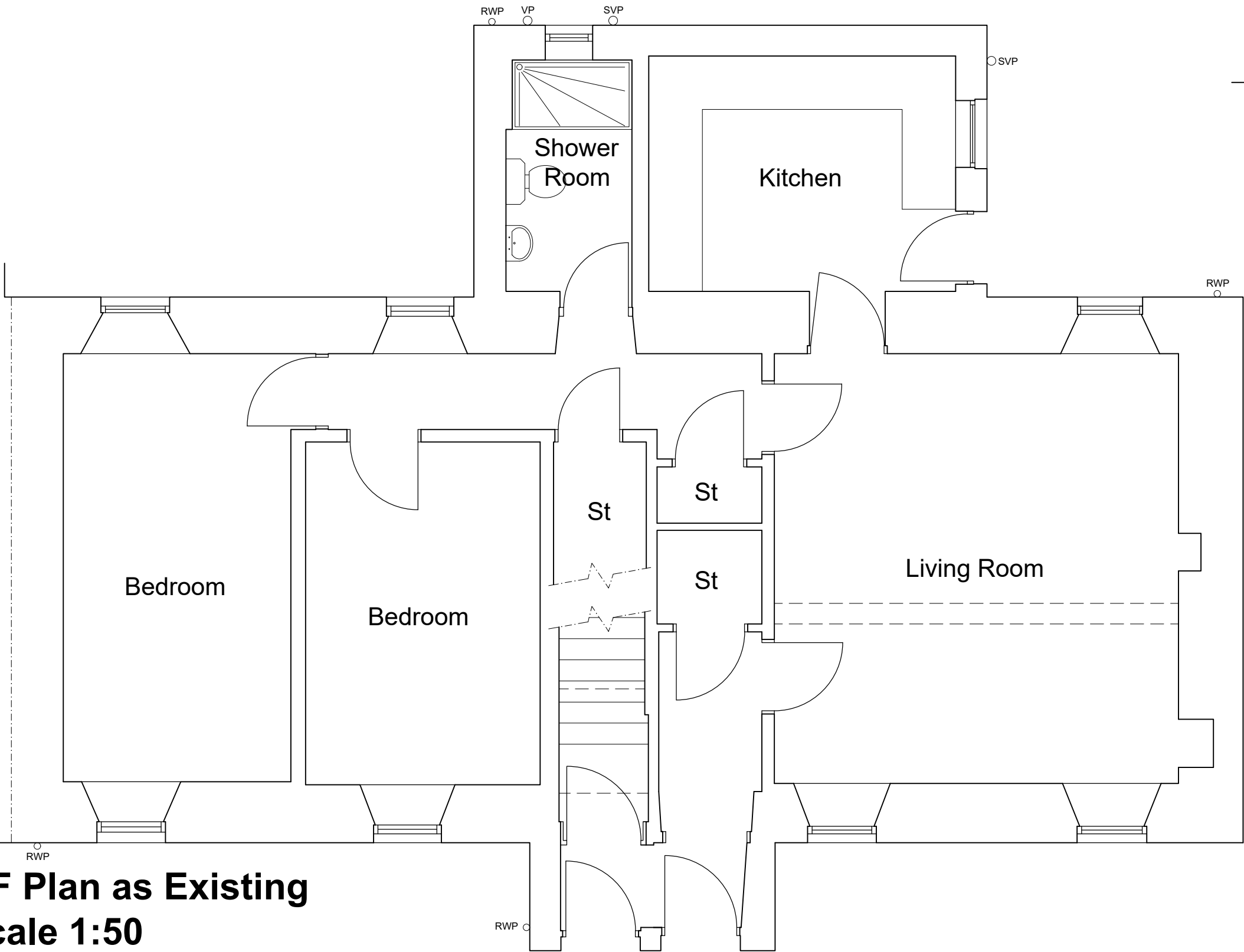
GF Plan as Existing Scale 1:50