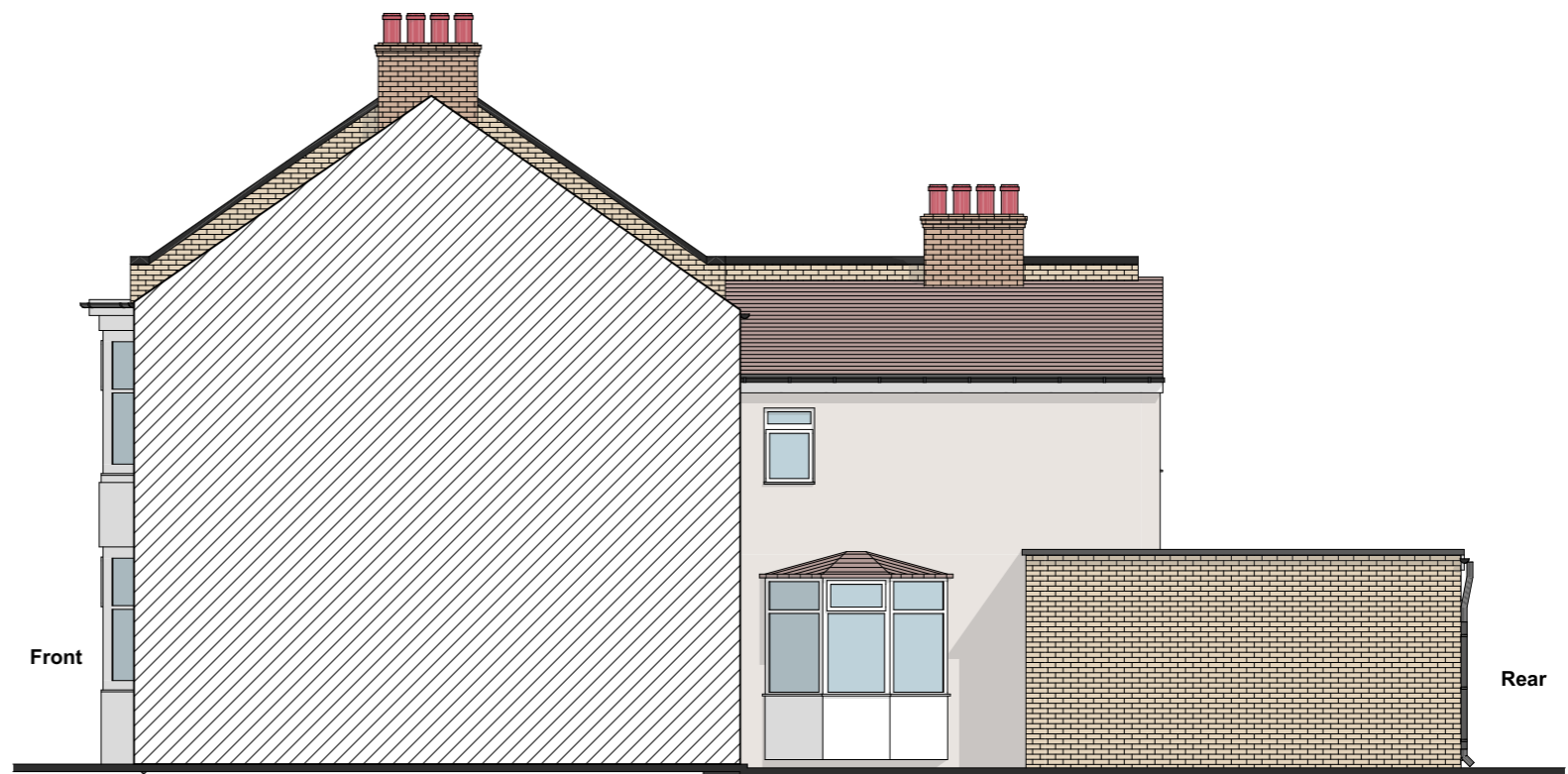
Existing Flank Elevation 1:100

COPYRIGHT: The contents of this drawing may not be reproduced in whole or in part without express written consent of ARKSS Design Limited.