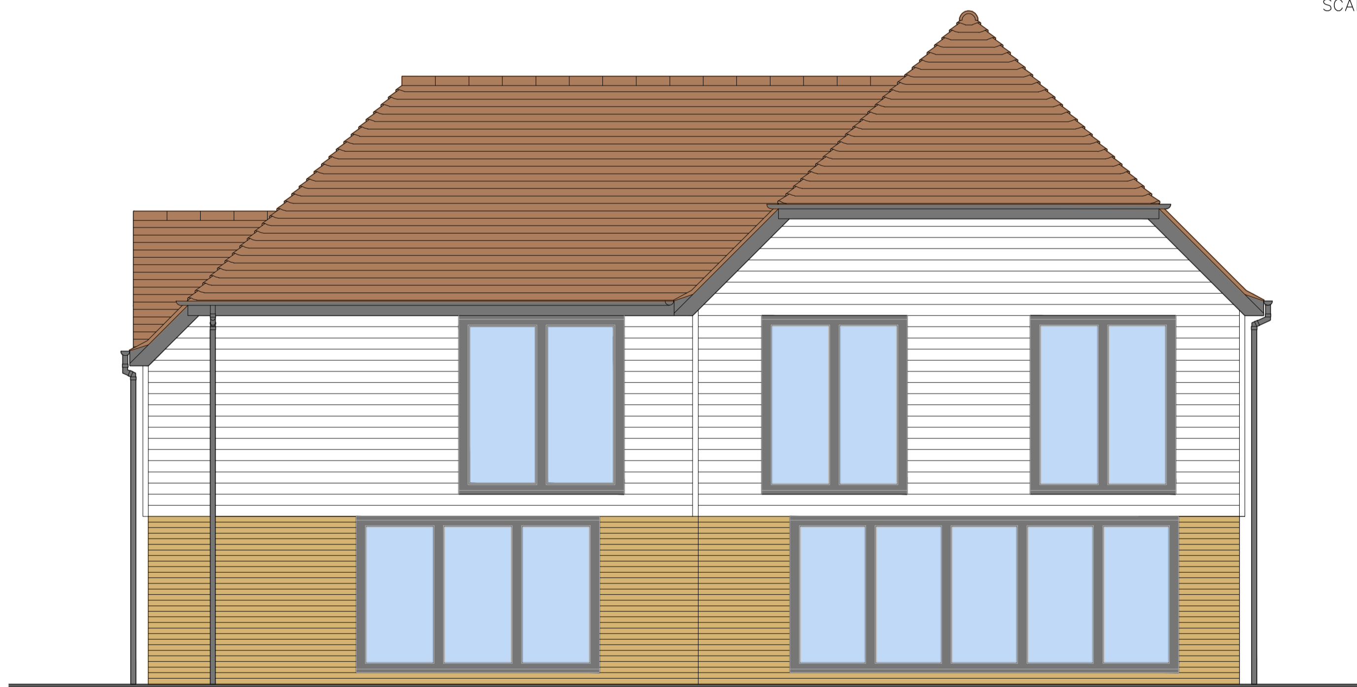
REAR (NORTHWEST) ELEVATION