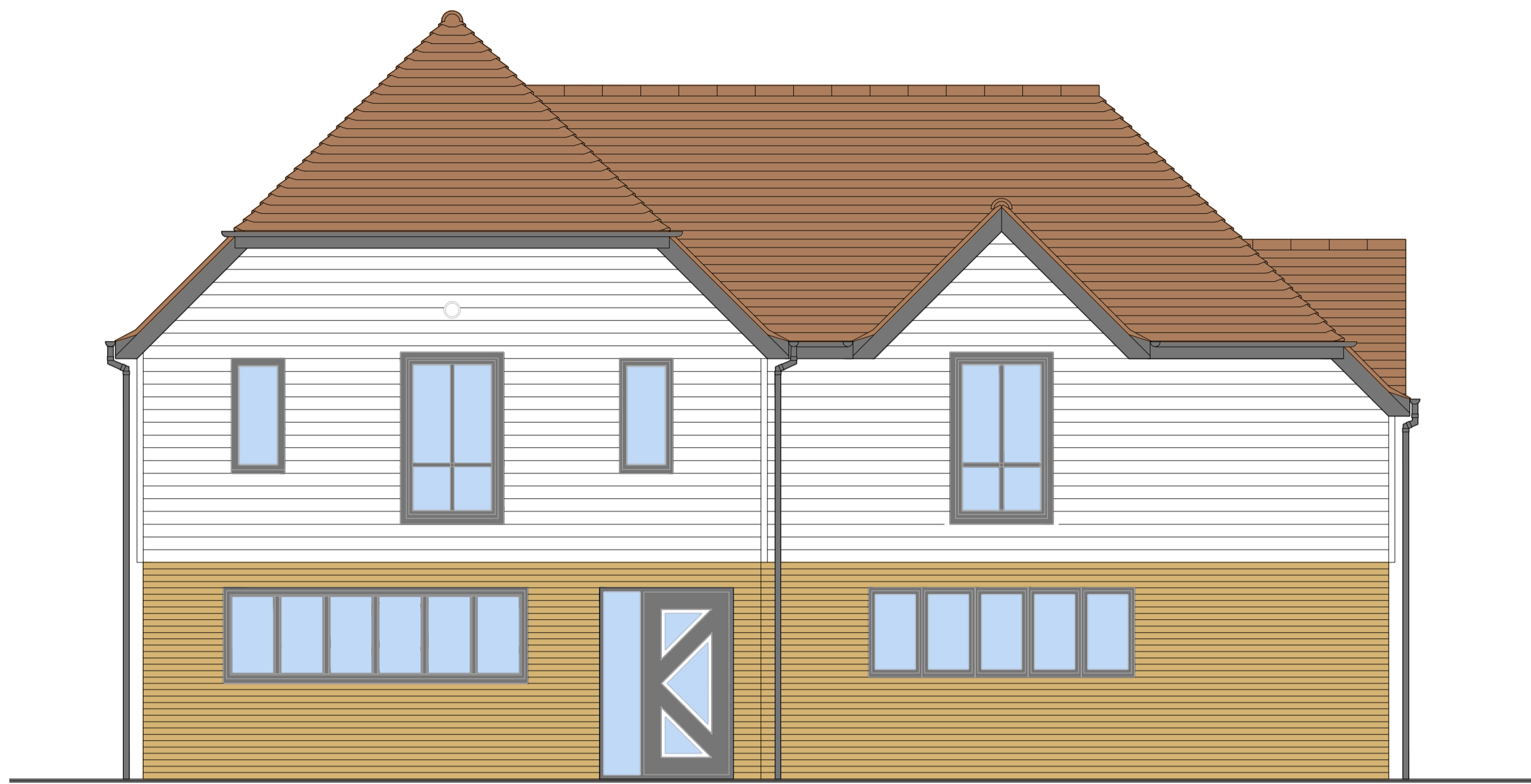
FRONT (SOUTHEAST) ELEVATION