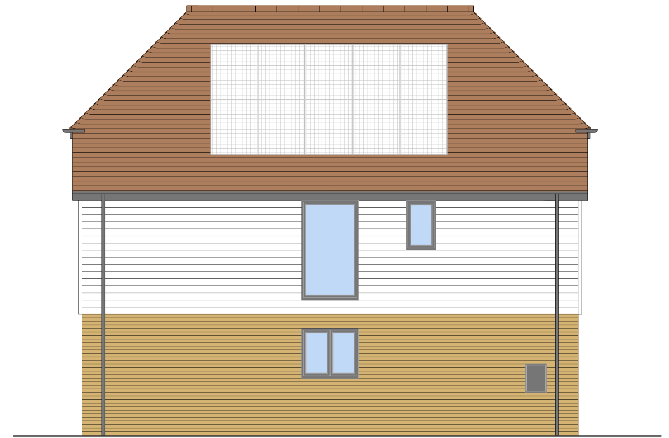
SIDE (SOUTHWEST) ELEVATION