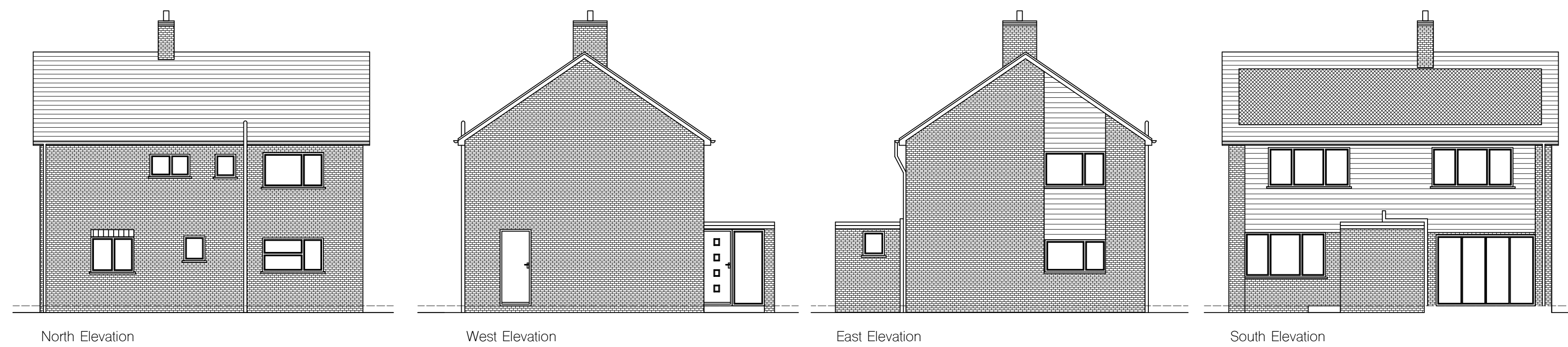
Existing Plans and Elevations | 1:100 @ A1