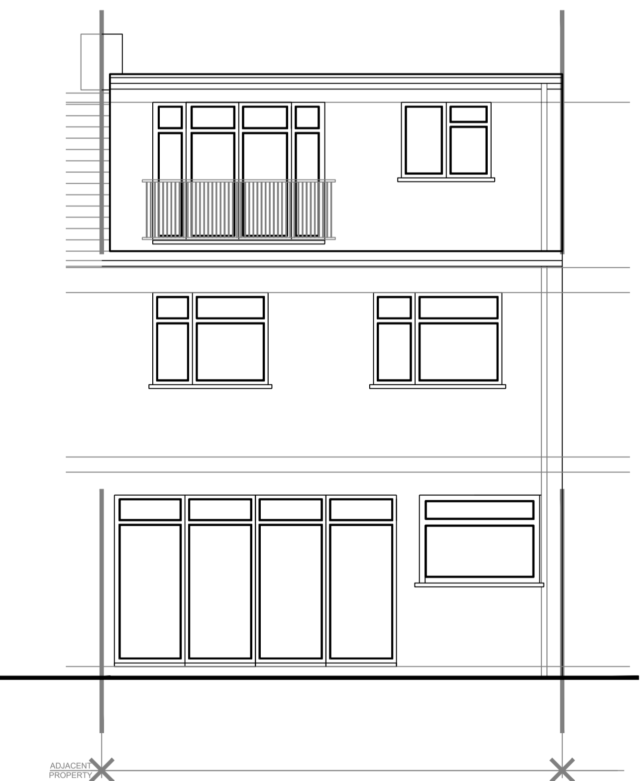
6 PROPOSED REAR ELEVATION SCALE 1:50