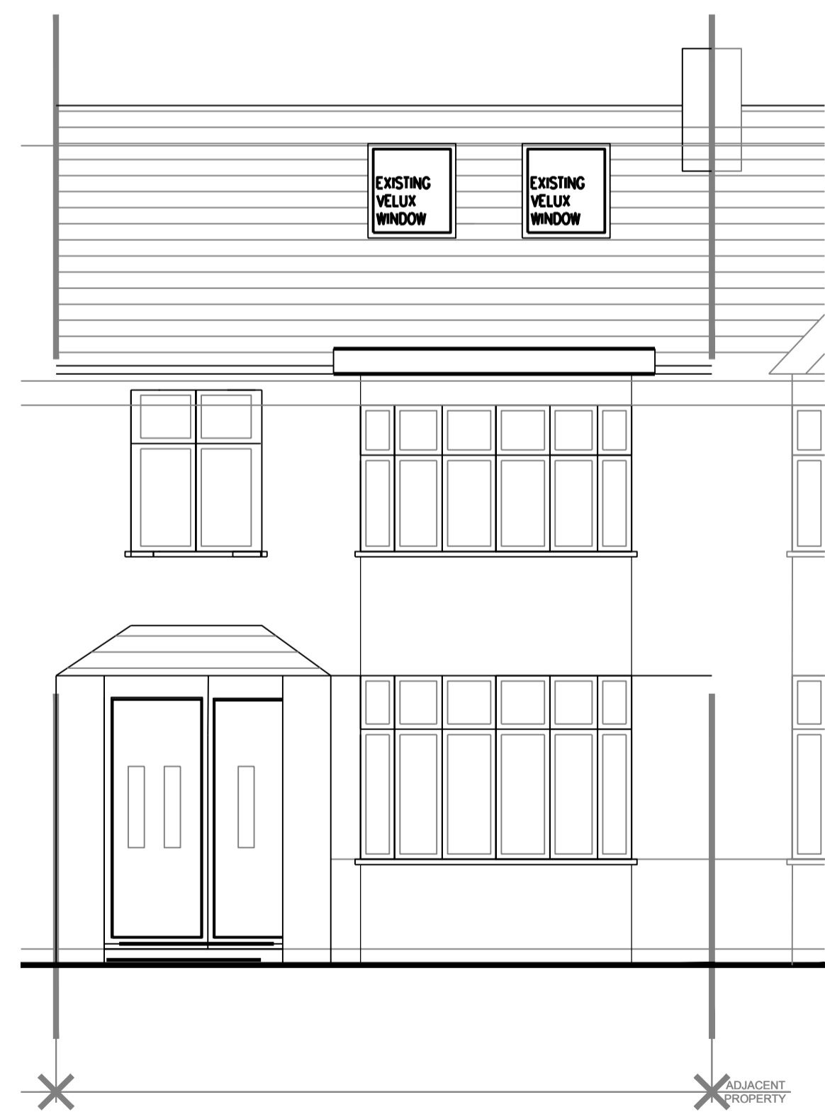
5 PROPOSED FRONT ELEVATION SCALE 1:50