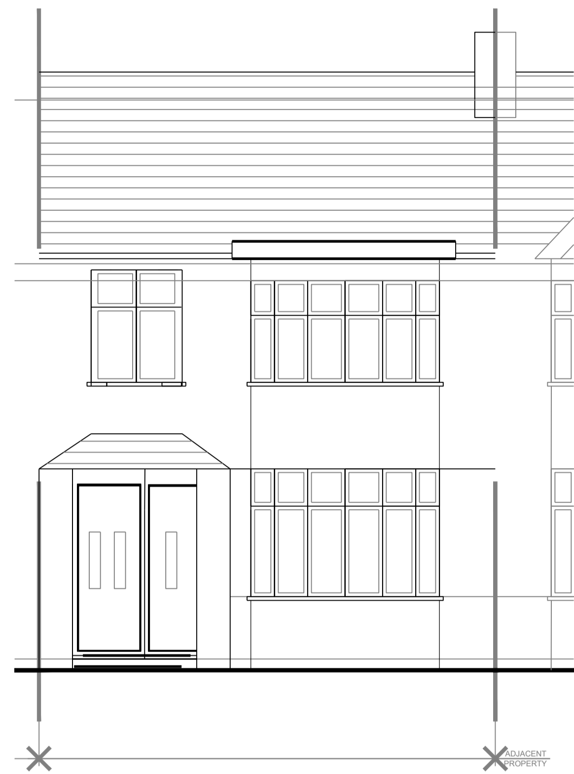
5 EXISTING FRONT ELEVATION SCALE 1:50