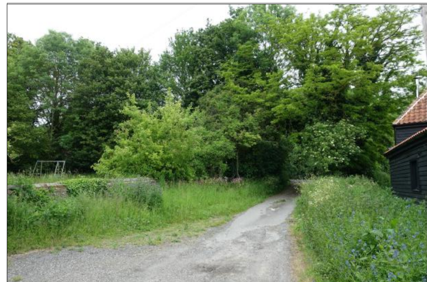
View looking Northeast towards entrance showing 1.5m high garden wall, 3.5m section to be removed as indicated on block plan