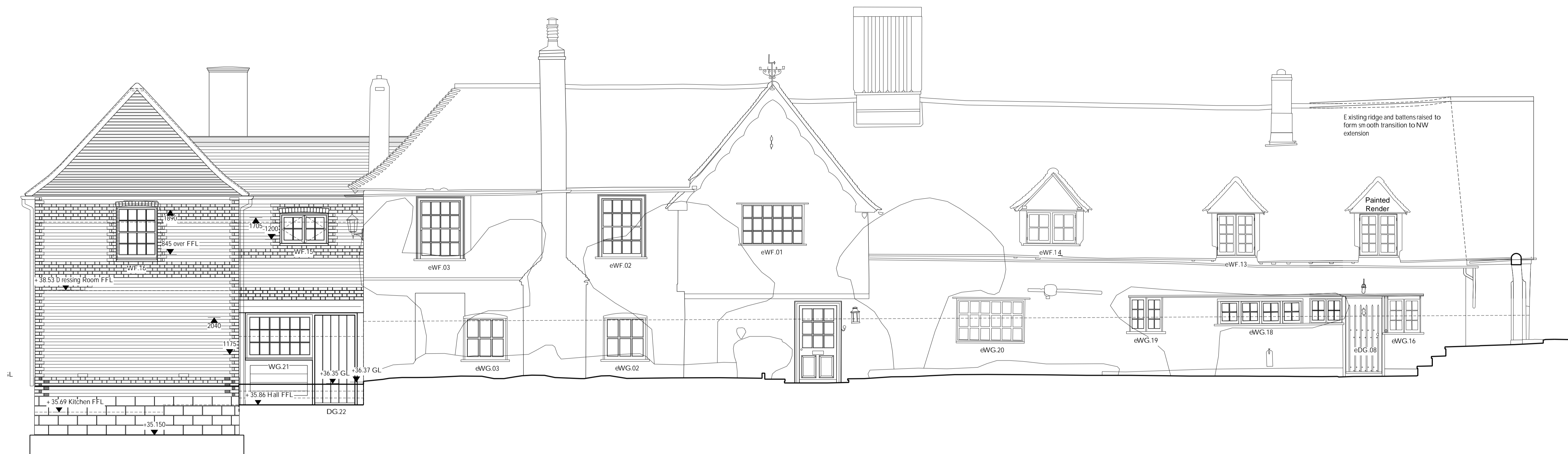
3 SOUTH EAST ELEVATION Existing 1:50