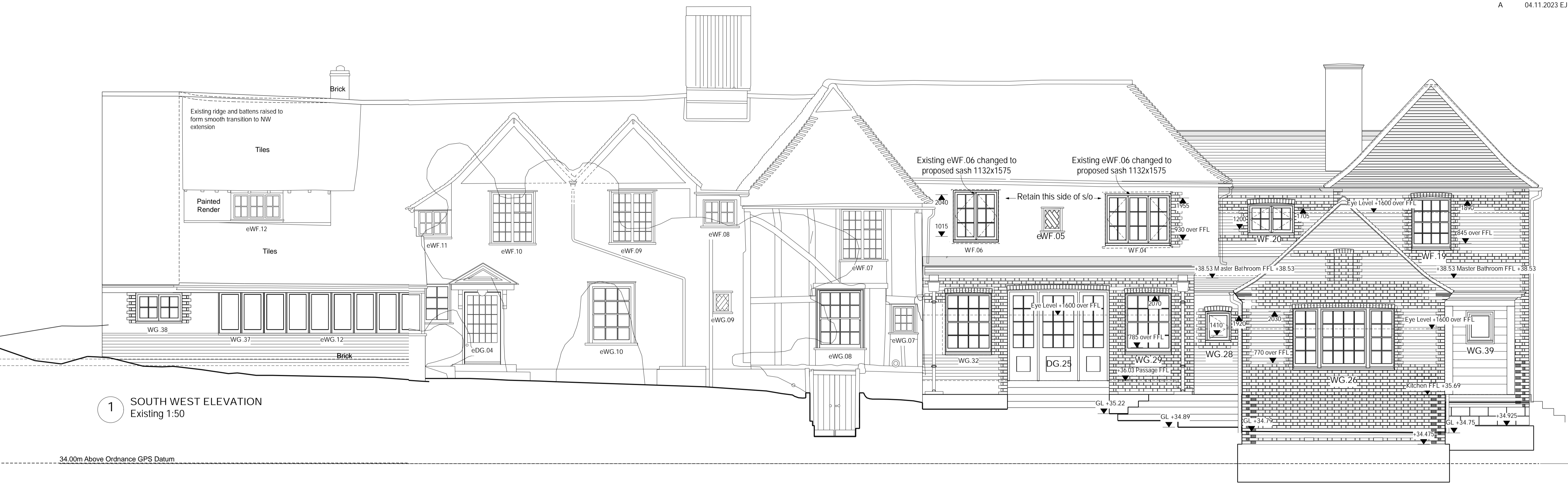
1 SOUTH WEST ELEVATION Existing 1:50