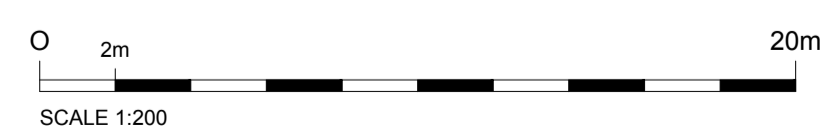
01 Proposed Site Layout Plan 1:200

Datum point - 61.70 (Base of granite gate post) Finished floor levels: Plot A - GFFL = 61.60 Plot B - GFFL = 62.50