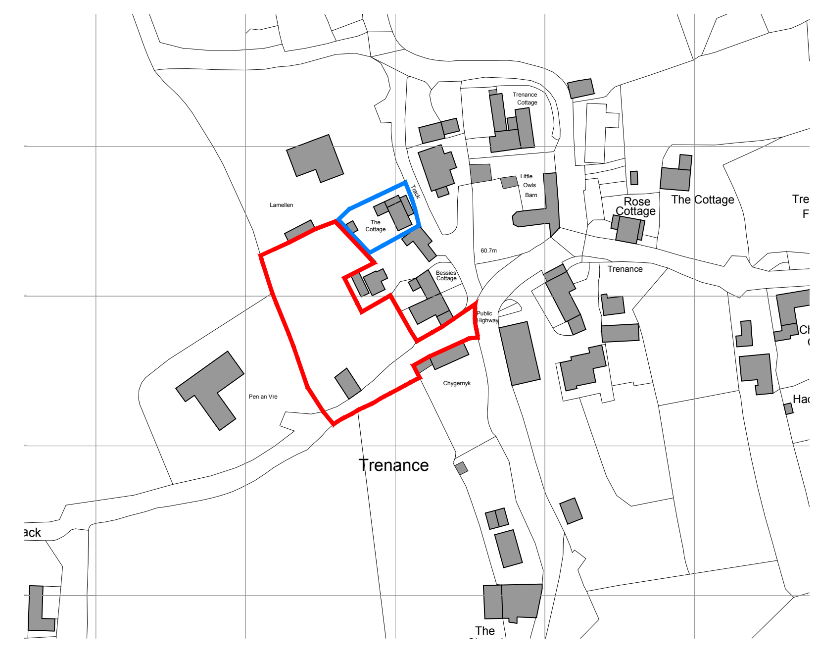
03 Existing Location Plan 1:1250

Rev A. 30.10.23 Datum and various site levels added following comments from Cornwall Council