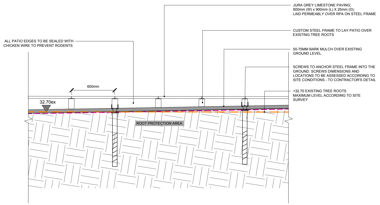
02 TYPICAL PAVING DETAIL WITHIN RPA 401 SECTION SCALE 1:20

NOTE: CUT UNITS ARE TO BE MINIMUM 1/3 OF A PAVING UNIT