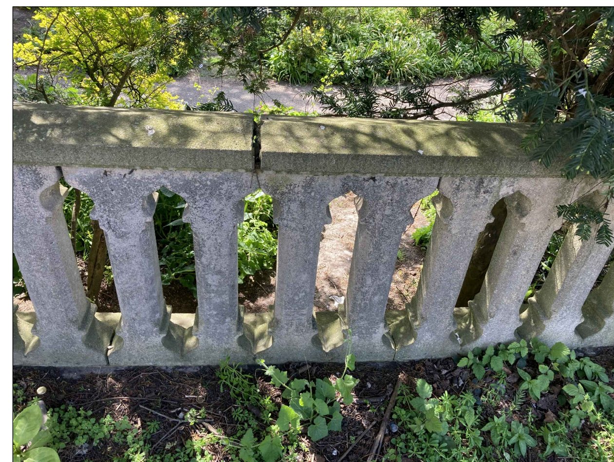
7 Part Elevation of McLaren Wall 5022 NTS