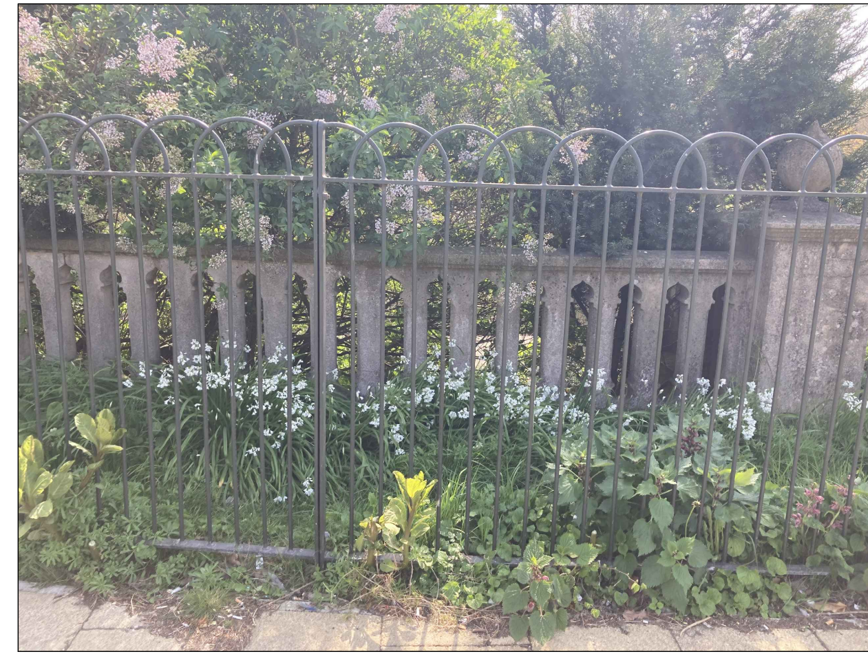
3 Part Elevation of McLaren Wall 5022 NTS