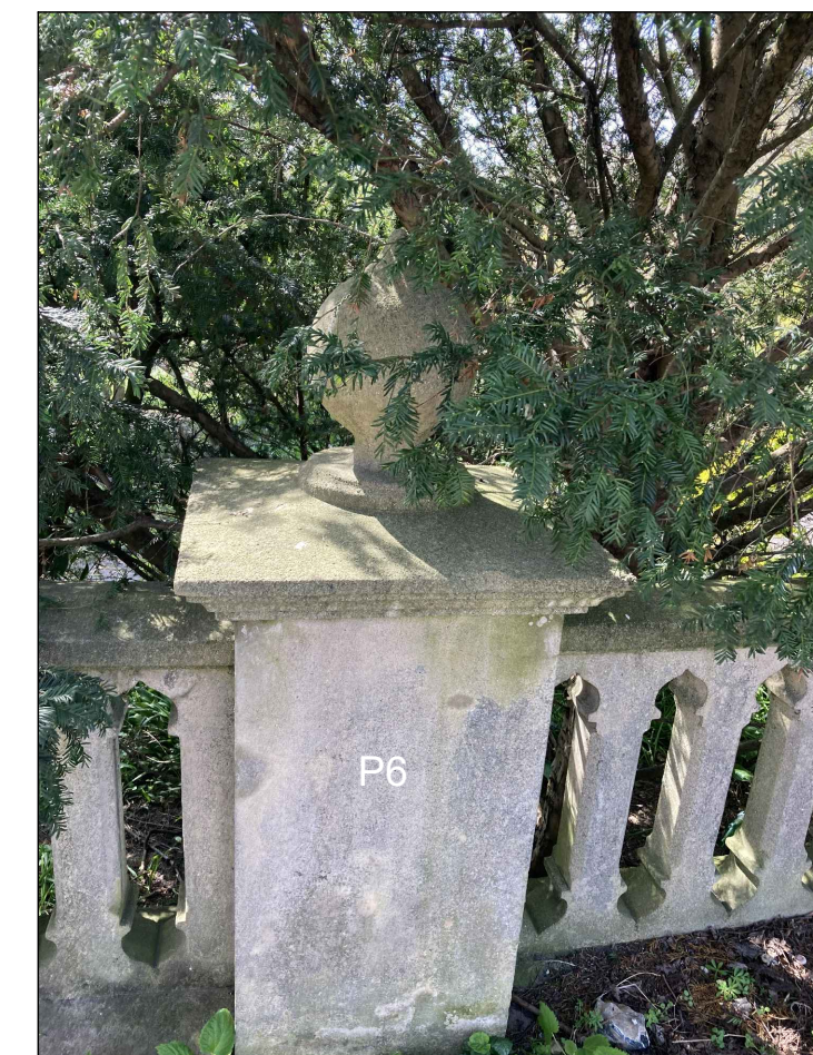
8 Part Elevation of McLaren Wall 5022 NTS