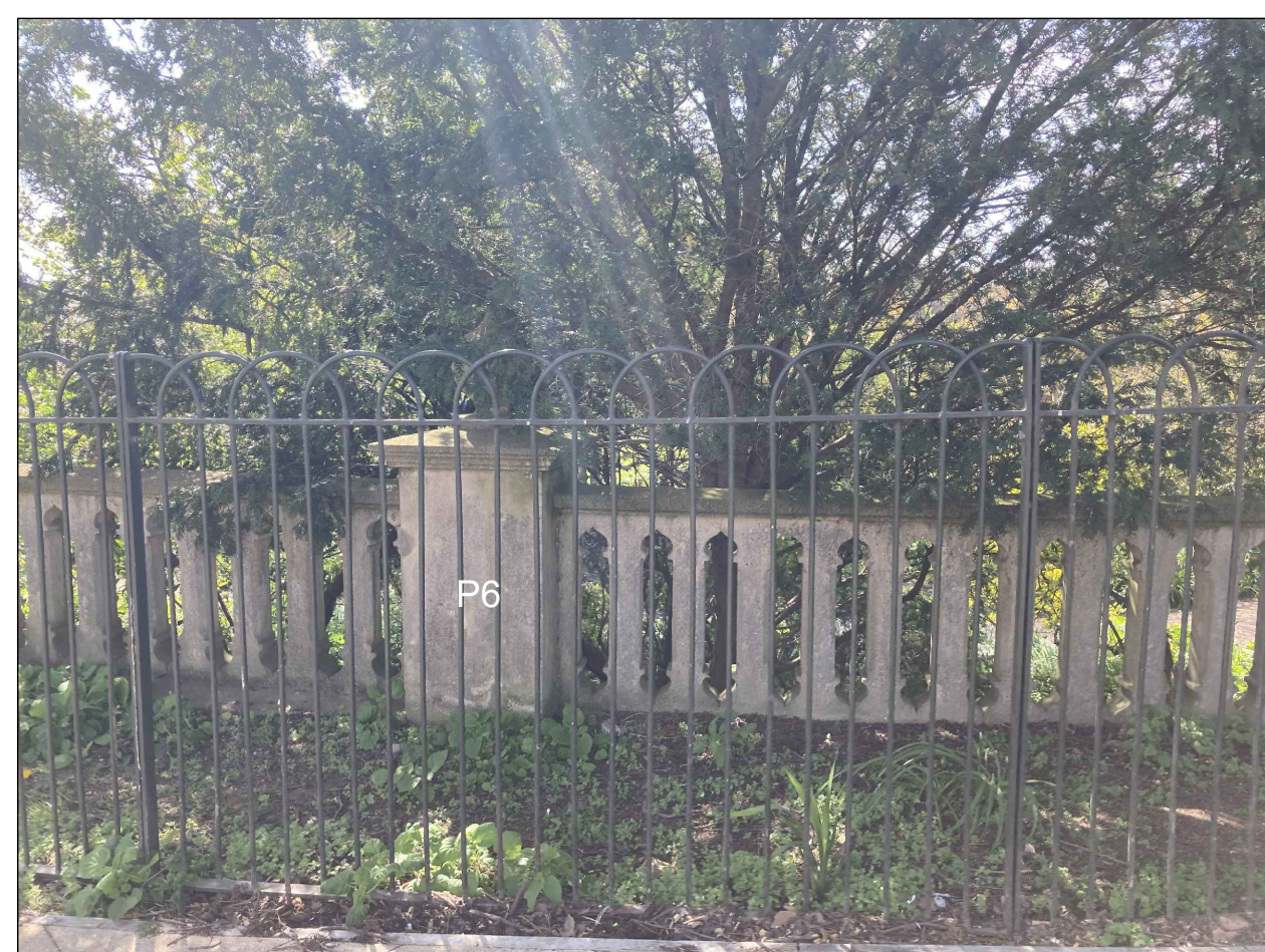
9 Part Elevation of McLaren Wall 5022 NTS