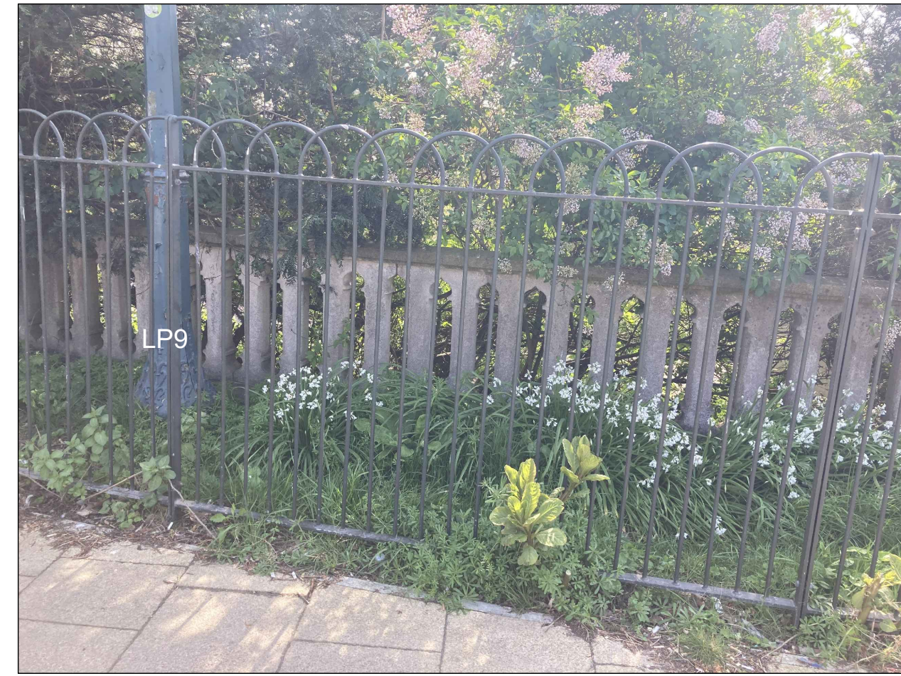
2 Part Elevation of McLaren Wall 5022 NTS