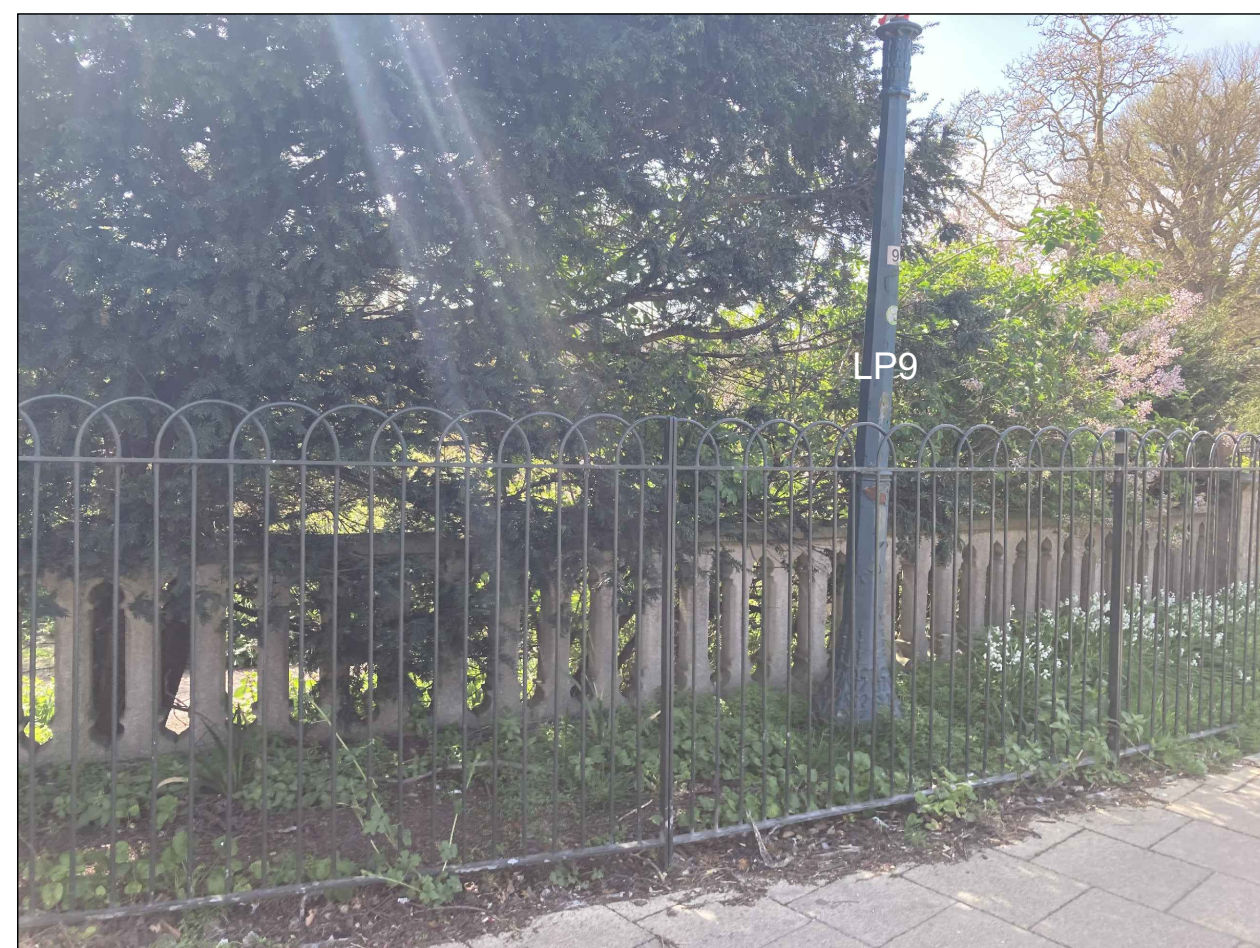
5 Part Elevation of McLaren Wall 5022 NTS