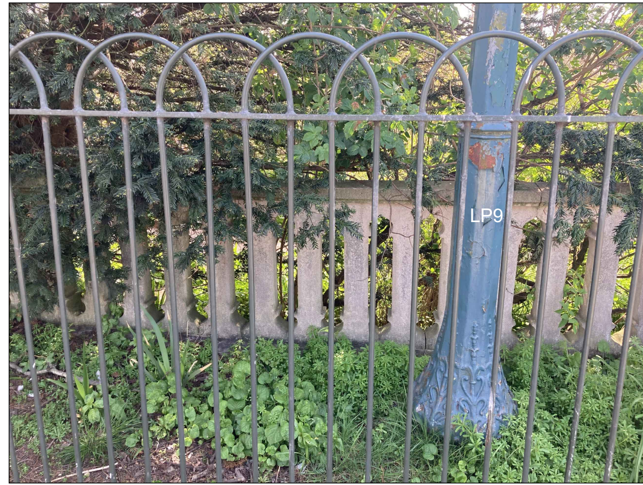
1 Part Elevation of McLaren Wall 5022 NTS

These drawings show the elevation of the McLaren Wall on the outside of the park boundary. Refer to drawings 5001 to 5016 for details of the repairs.