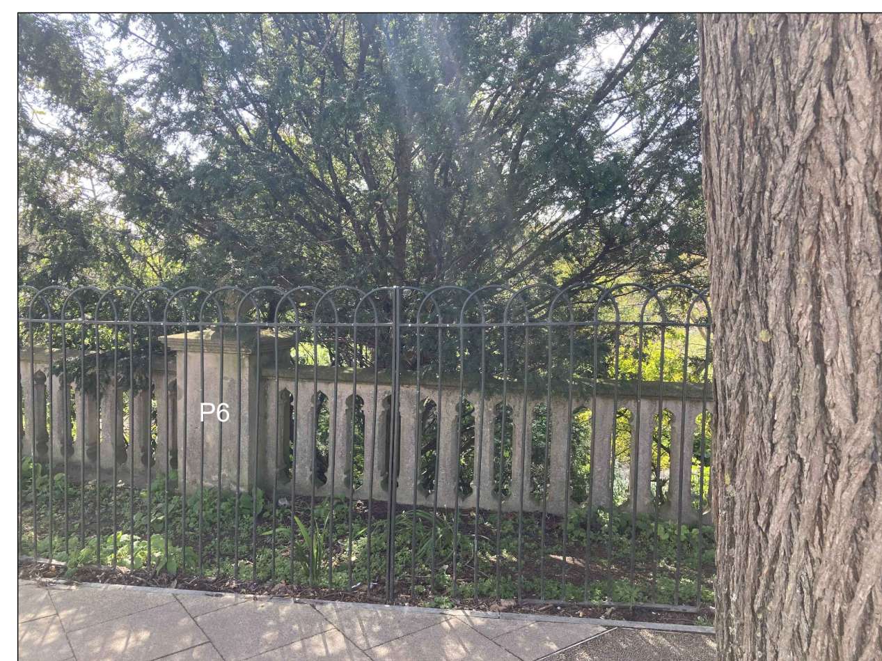
10 Part Elevation of McLaren Wall 5022 NTS