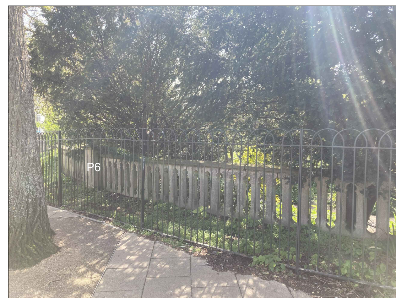
11 Part Elevation of McLaren Wall 5022 NTS