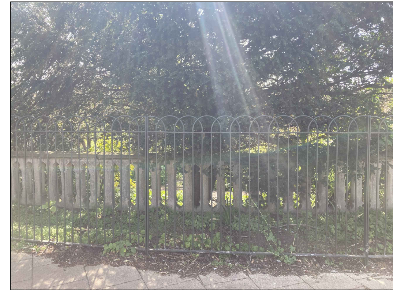
4 Part Elevation of McLaren Wall 5022 NTS