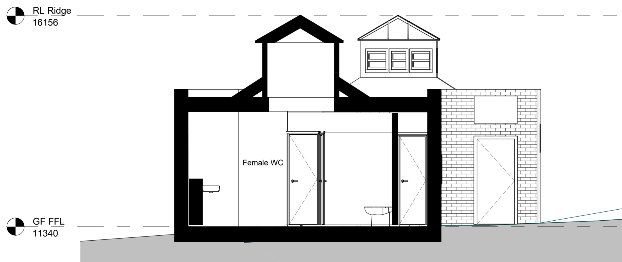
2 Section B-B 1200 1 : 50