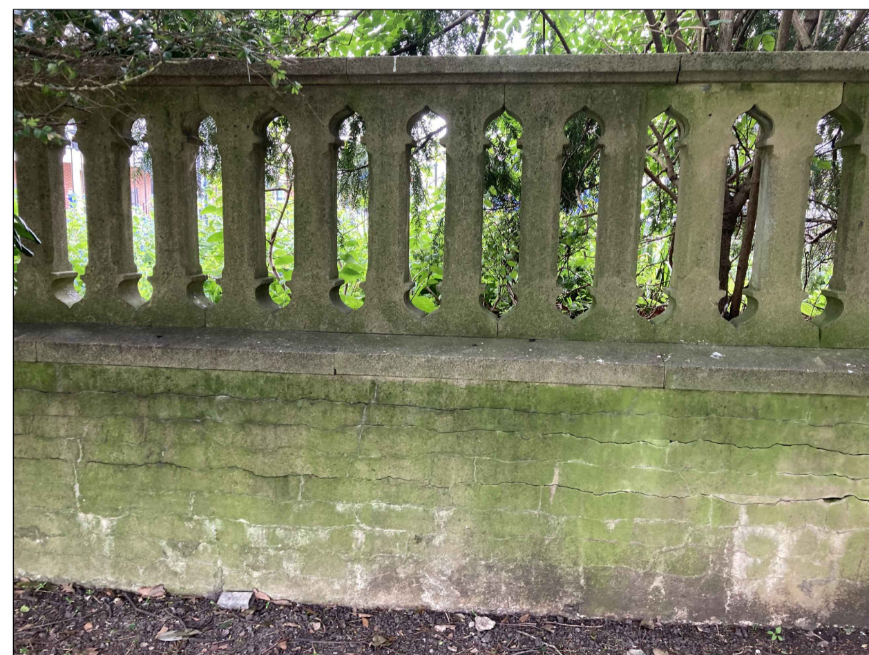
11 Part Elevation of McLaren Wall 5012 NTS