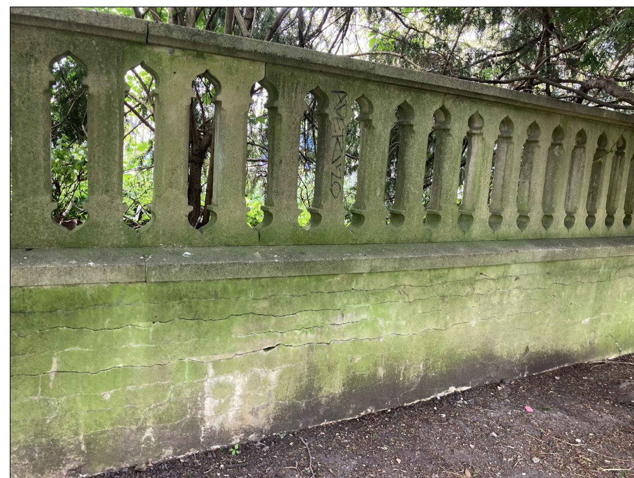
12 Part Elevation of McLaren Wall 5012 NTS