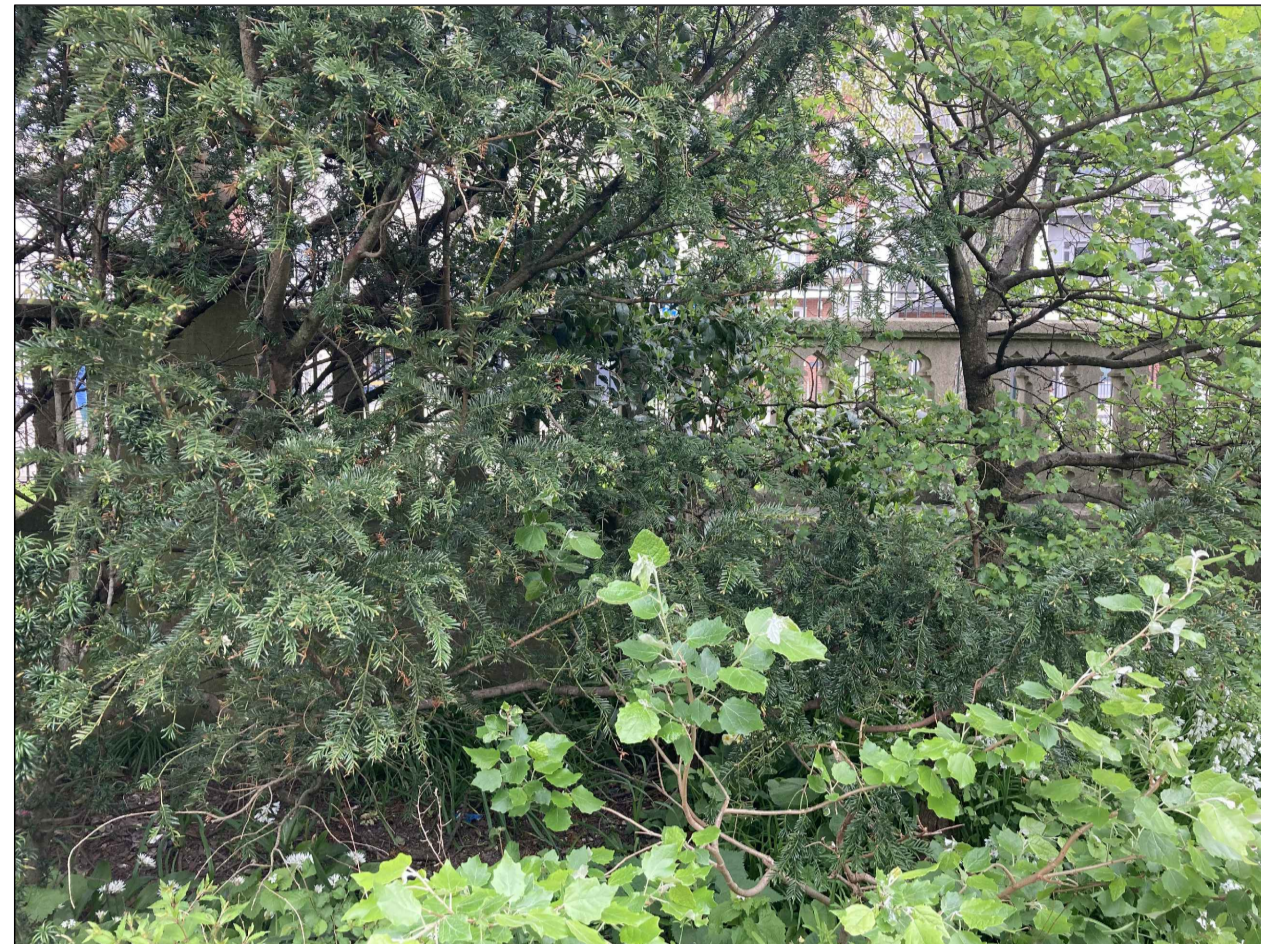
1 Part Elevation of McLaren Wall 5012 NTS

Crack - refer to SE for any remedial works.