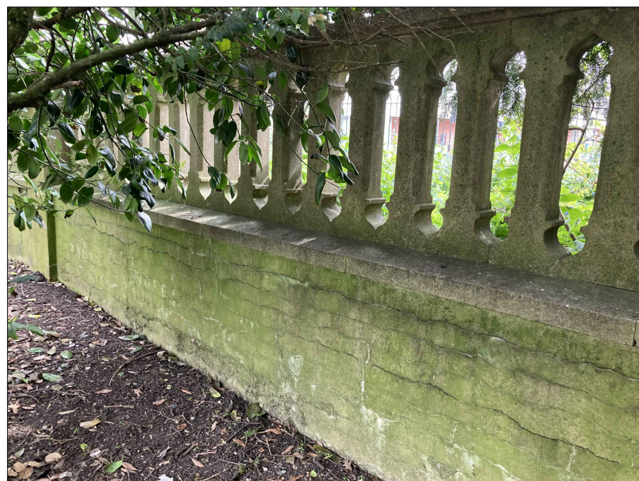
10 Part Elevation of McLaren Wall 5012 NTS