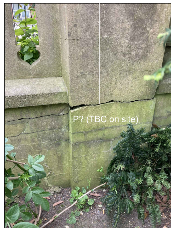
6 Part Elevation of McLaren Wall 5012 NTS