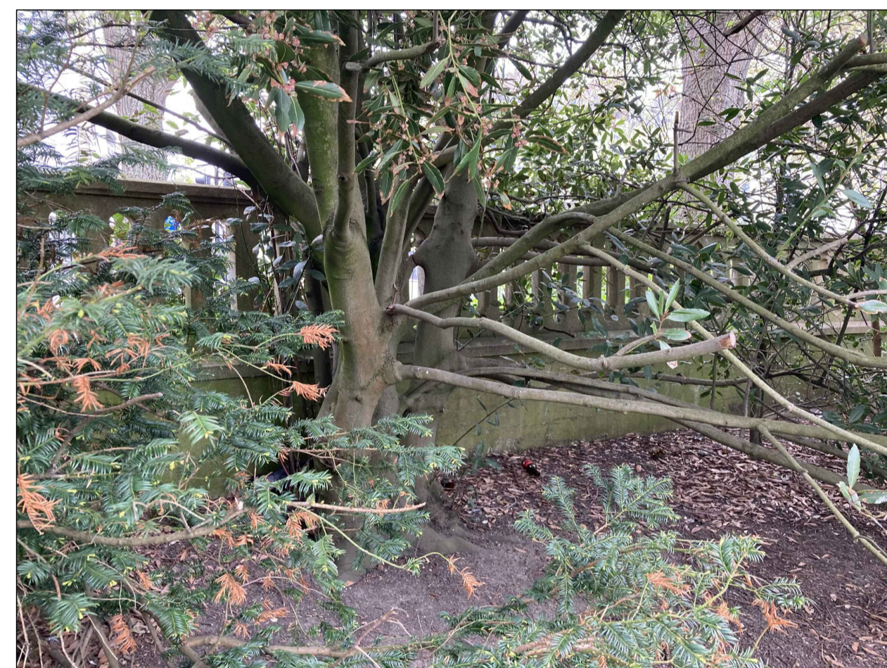
7 Part Elevation of McLaren Wall 5012 NTS