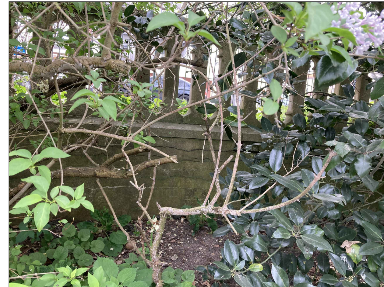
4 Part Elevation of McLaren Wall 5012 NTS