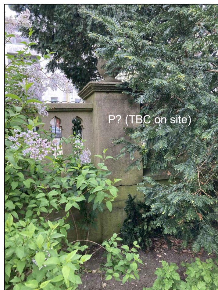
5 Part Elevation of McLaren Wall 5012 NTS