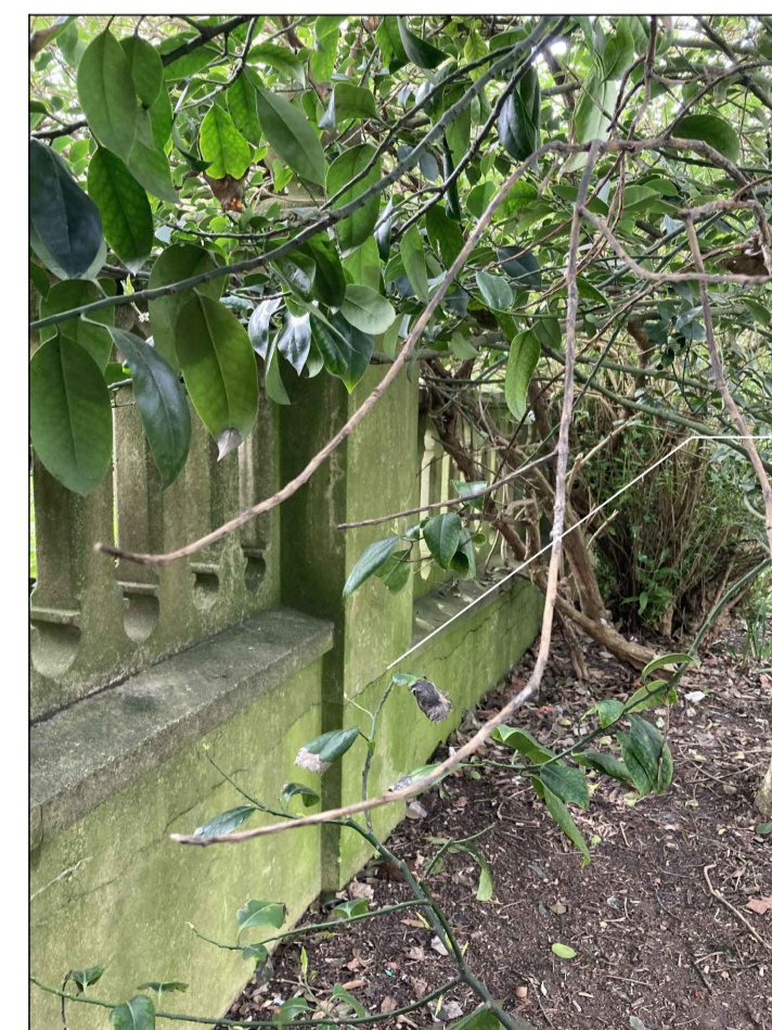
13 Part Elevation of McLaren Wall 5012 NTS

Crack - refer to SE for any remedial works.