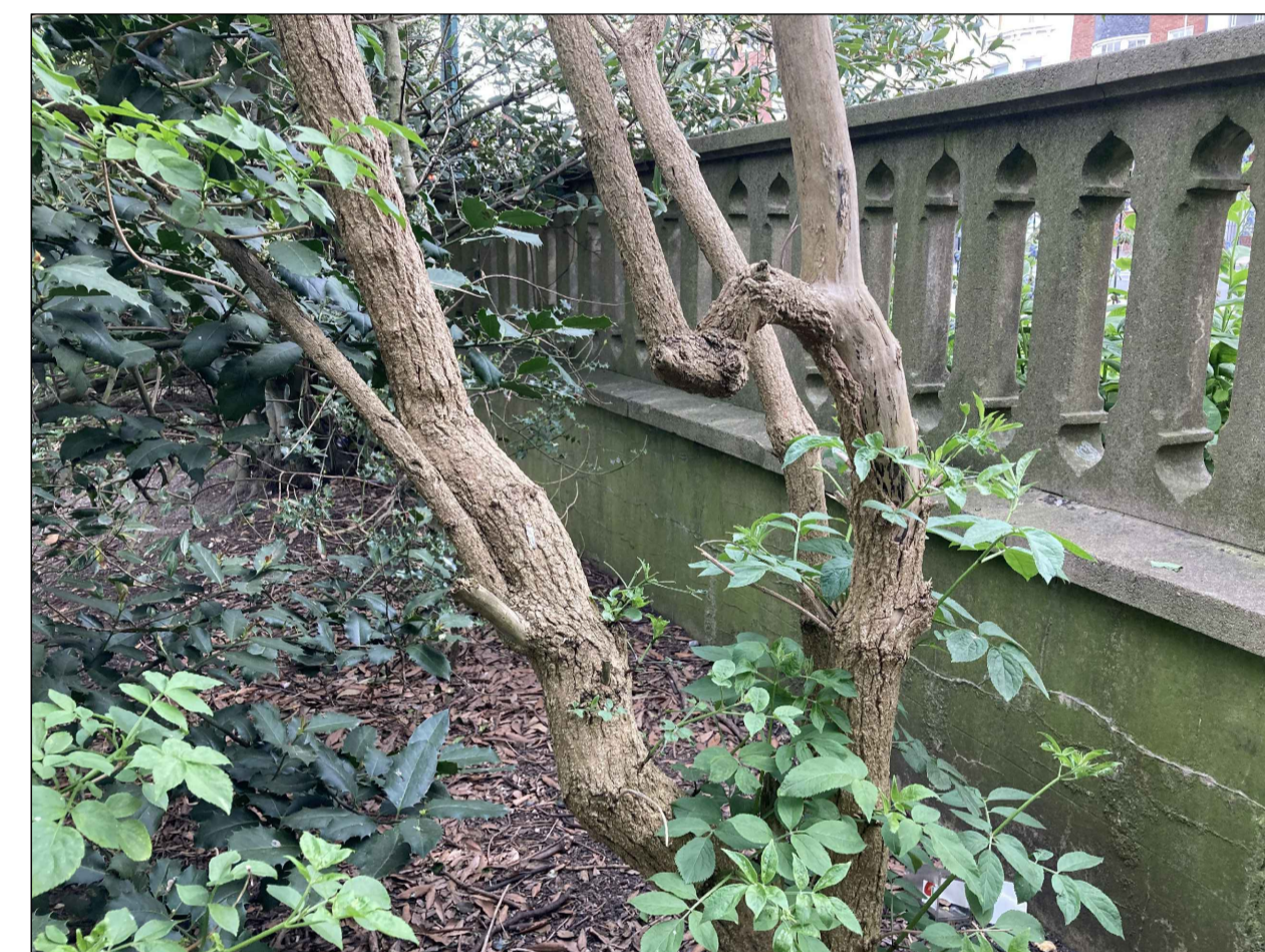
8 Part Elevation of McLaren Wall 5012 NTS