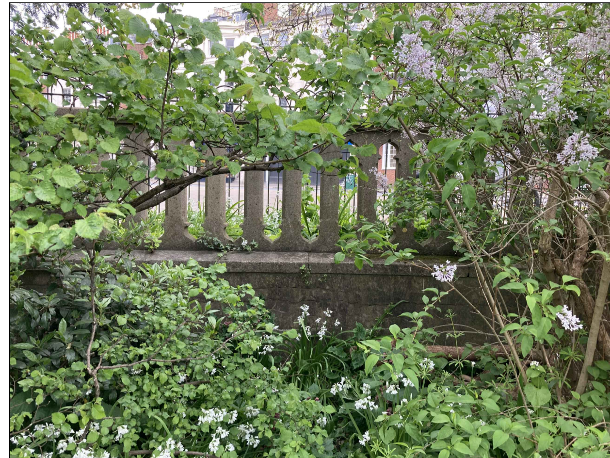
2 Part Elevation of McLaren Wall 5012 NTS

Crack - refer to SE for any remedial works.