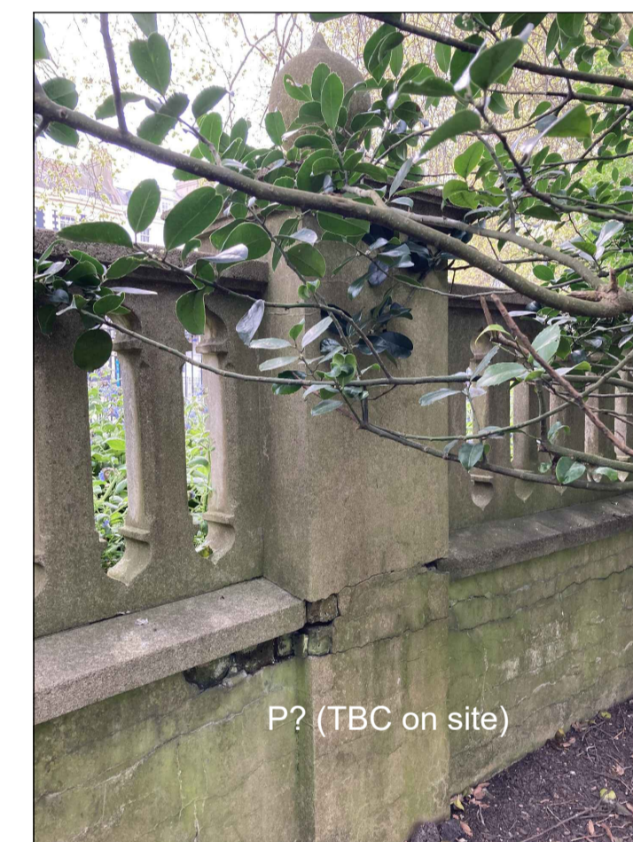
9 Part Elevation of McLaren Wall 5012 NTS