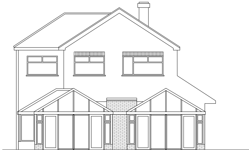
Rear (North) Elevation