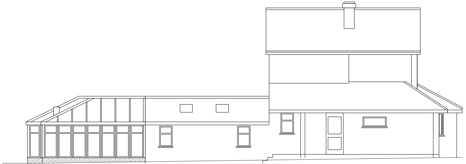
Side (West) Elevation