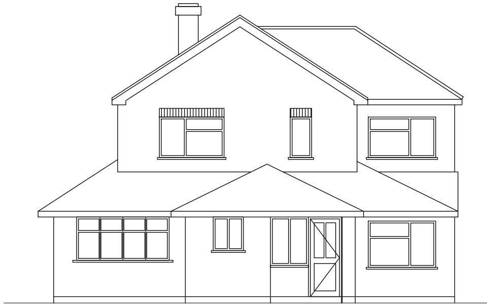
Front (South) Elevation