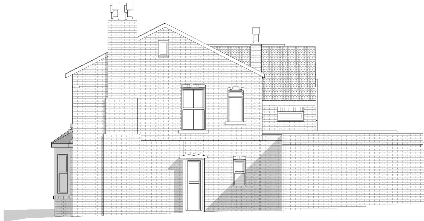
Existing no.2 elevation 1:100 @A3