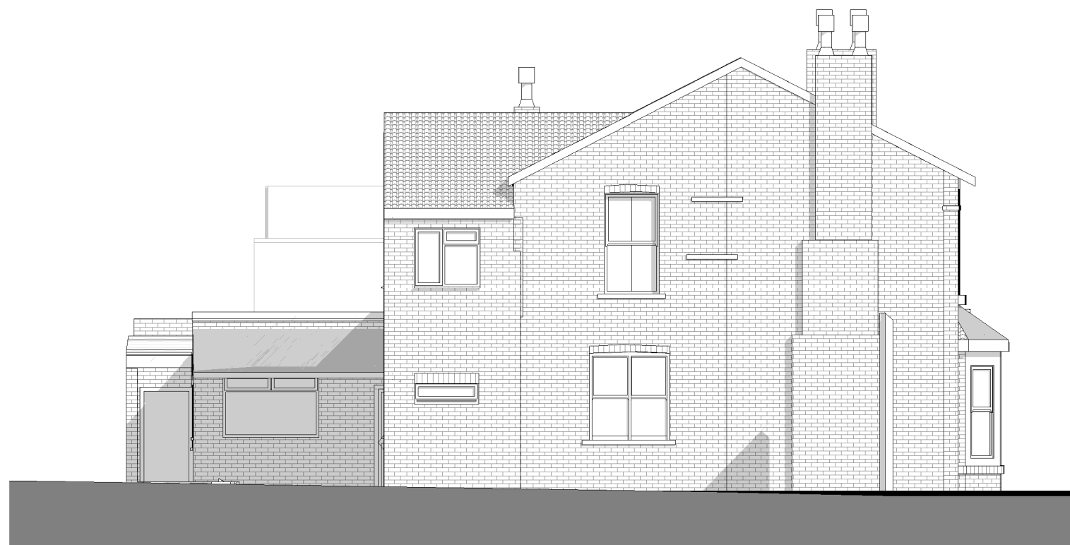
Existing no.4a elevation 1:100 @A3