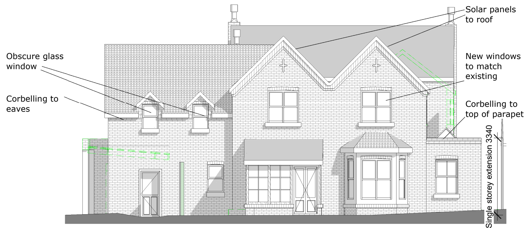
Proposed rear elevation 1:100 @A3

JLK Architectural Design 20 Wembley Gardens Nottingham NG9 3FE T 0115 877 1390 E info@jlkarchitecturaldesign.com