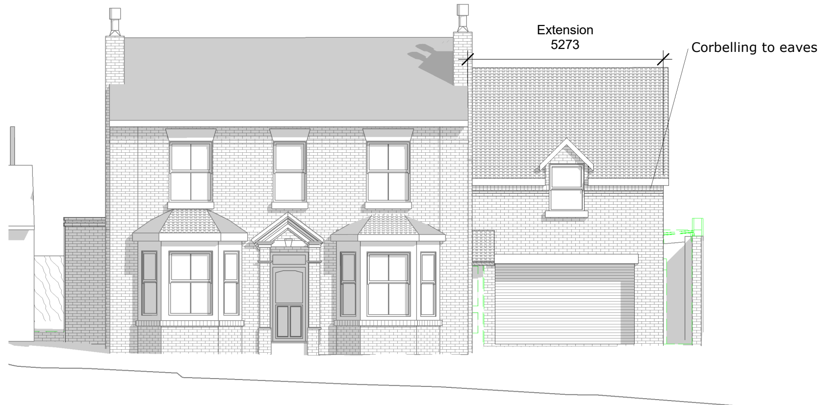
Proposed Cropwell Road elevation 1:100 @A3