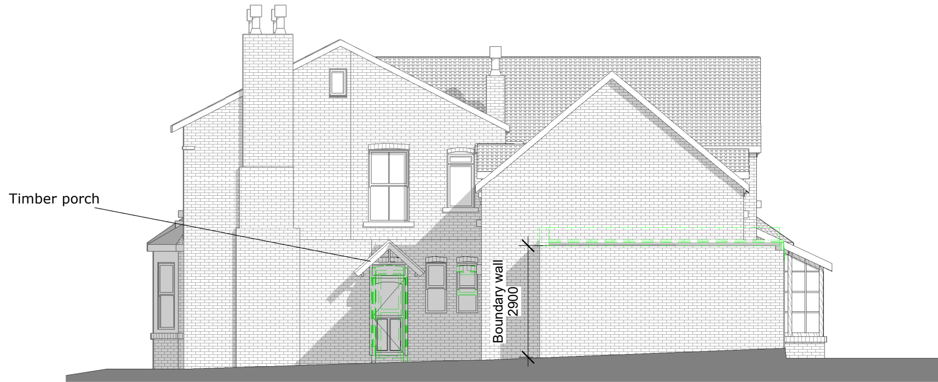
Proposed no.2 elevation 1:100 @A3