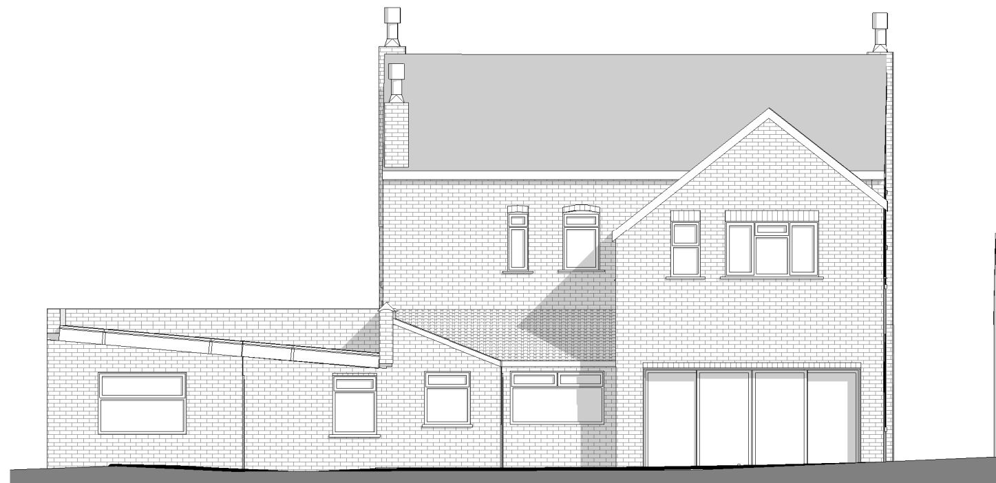
Existing rear elevation 1:100 @A3