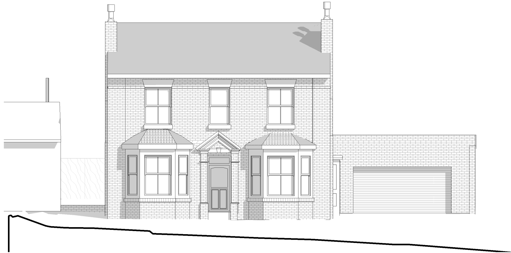
Existing Cropwell Road elevation 1:100 @A3