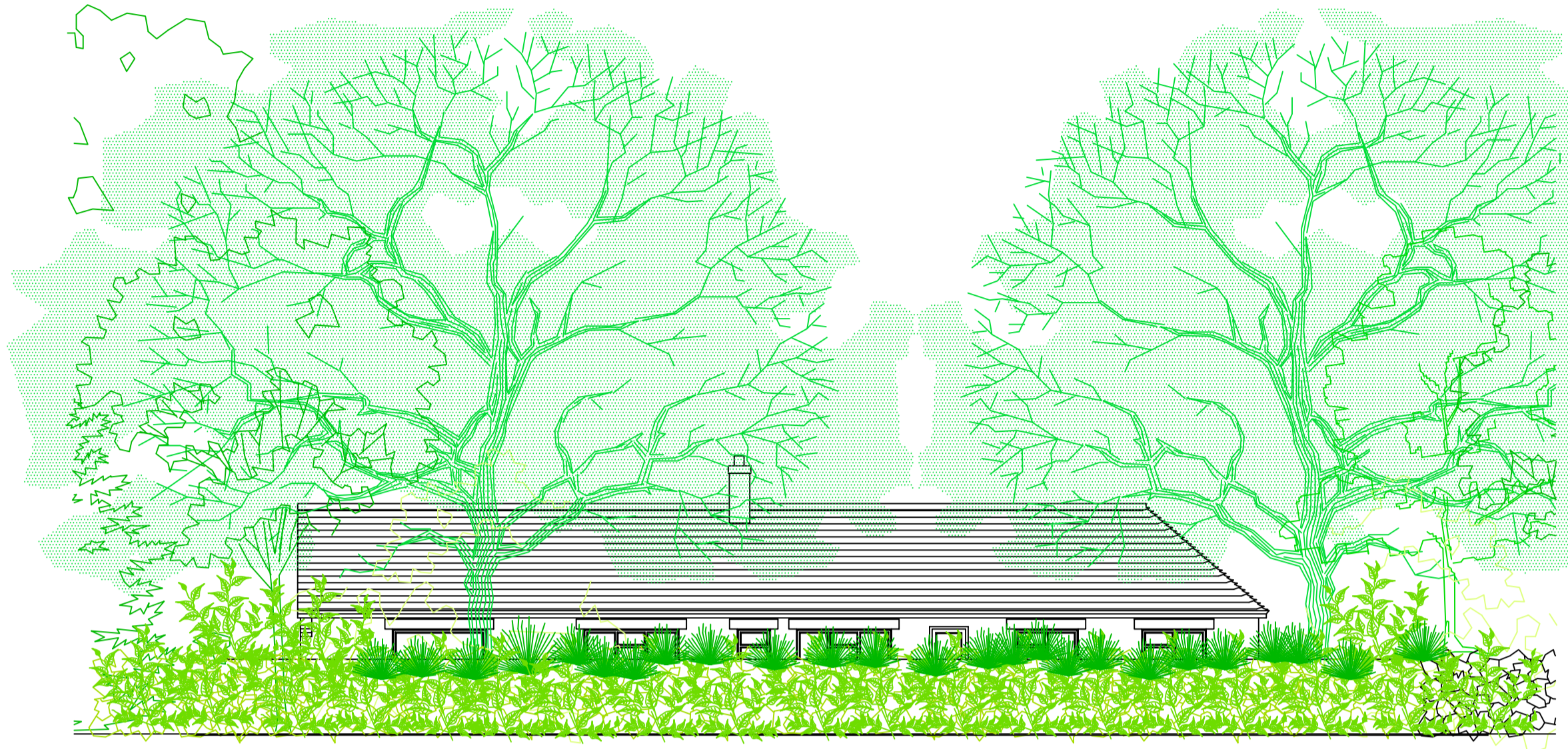
Existing East Elevation viewed from footpath Scale 1: 100