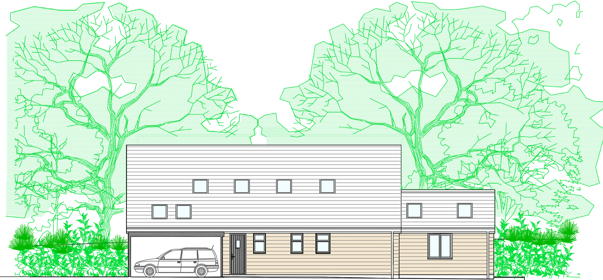
Proposed West Elevation (Section through garage) Scale 1:100