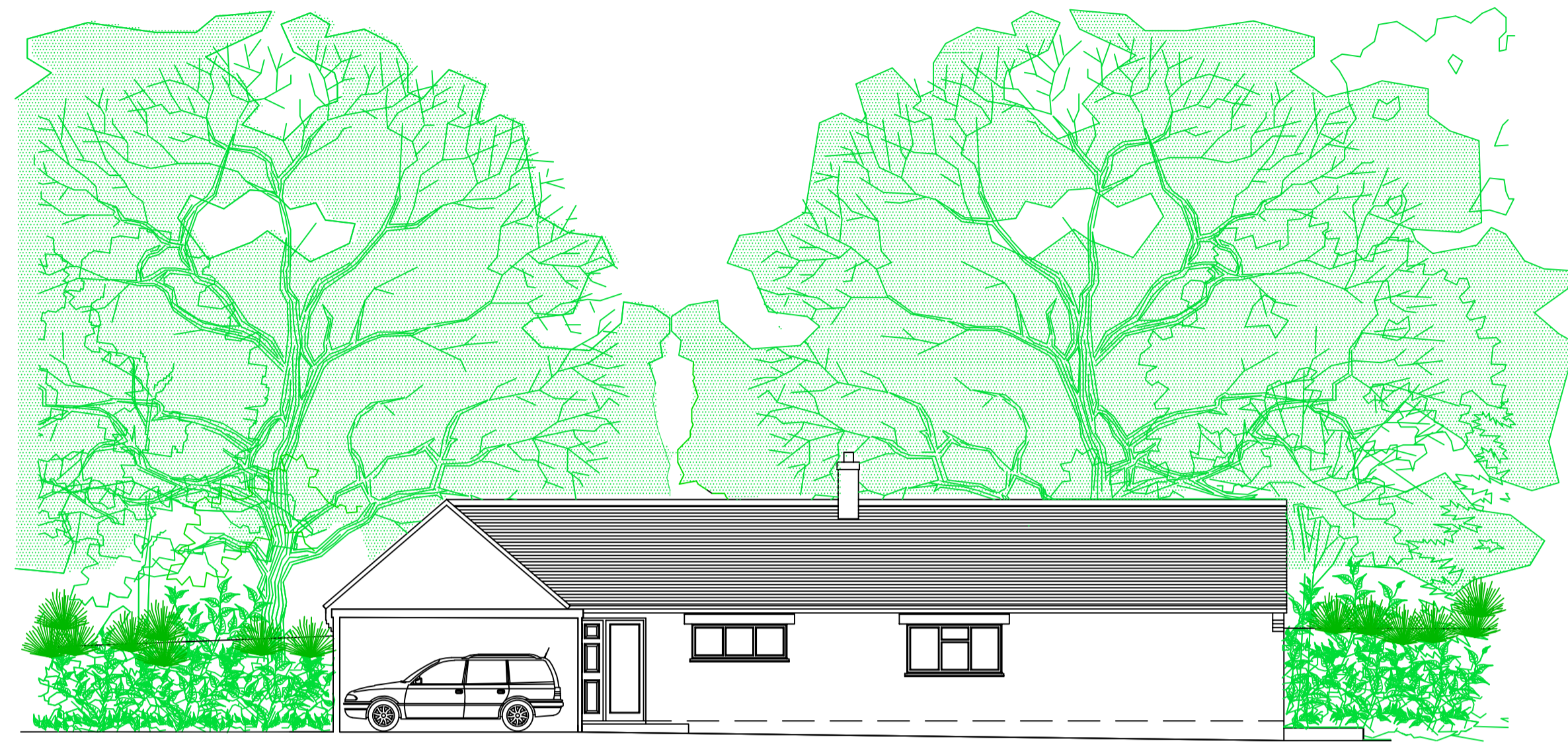
Existing West Elevation (Section through garage) Scale 1:100