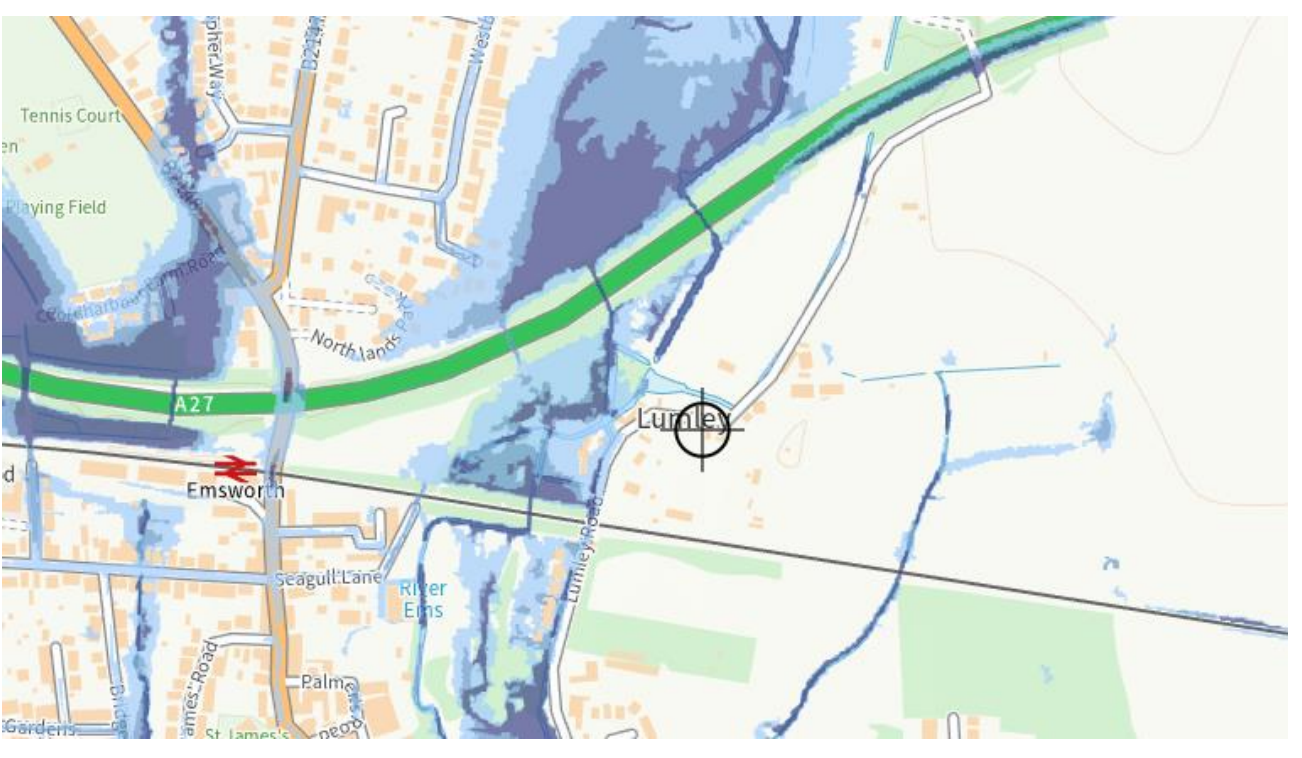
Figure 2. Extent of flooding from surface water. [check-long-term-flood-risk.service.gov.uk].