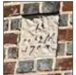
Date stone to front elevation '1795' in worn condition and in need of stabilisation.