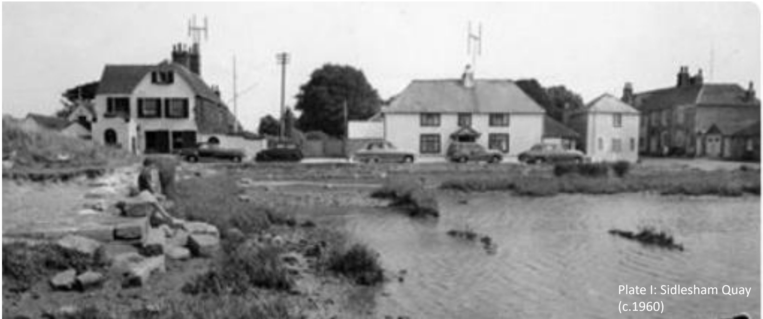
Plate I: Sidlesham Quay (c.1960)

ROSEMARY COTTAGE, SIDLESHAM, WEST SUSSEX