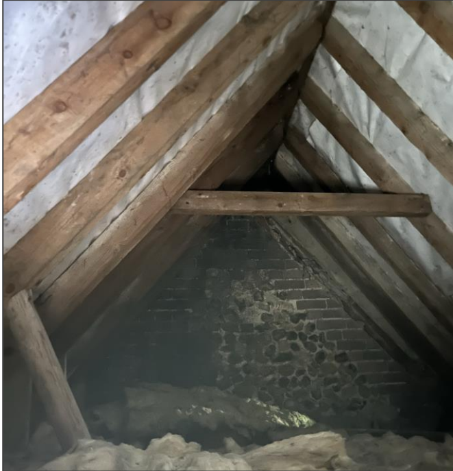
Attic space with coursed flintwork to gable and primarily modern rafters.