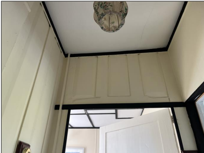
Vertical raised and fielded panelling at the head of the stairs is typical of late C18 or early C19 work.

Ceilings and partition walls at First Floor level are of modern construction including asbestos cement boarding, fibreboard and plywood. The external walls were noted to be damp in many areas.