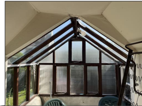
Poorly constructed modern conservatory