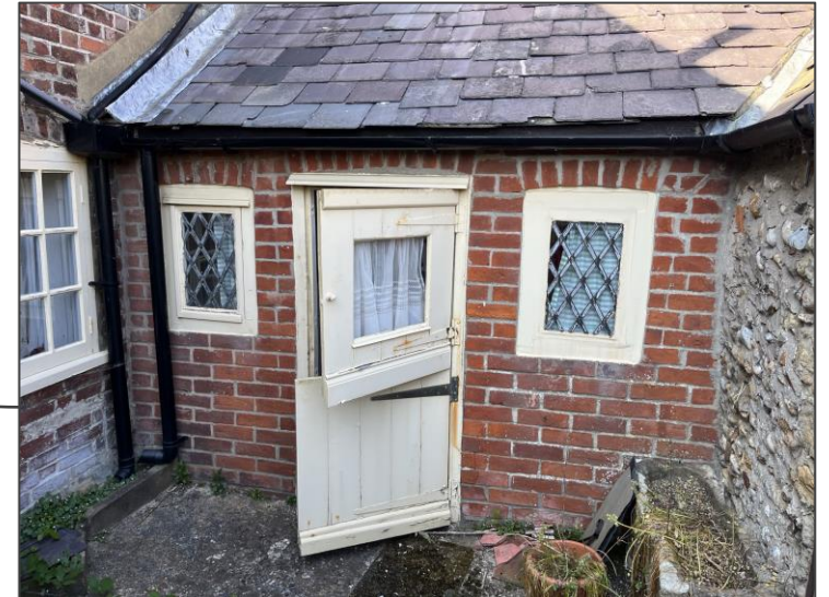
Modern brickwork and flintwork with cement mortar and external joinery. Modern concrete courtyard.