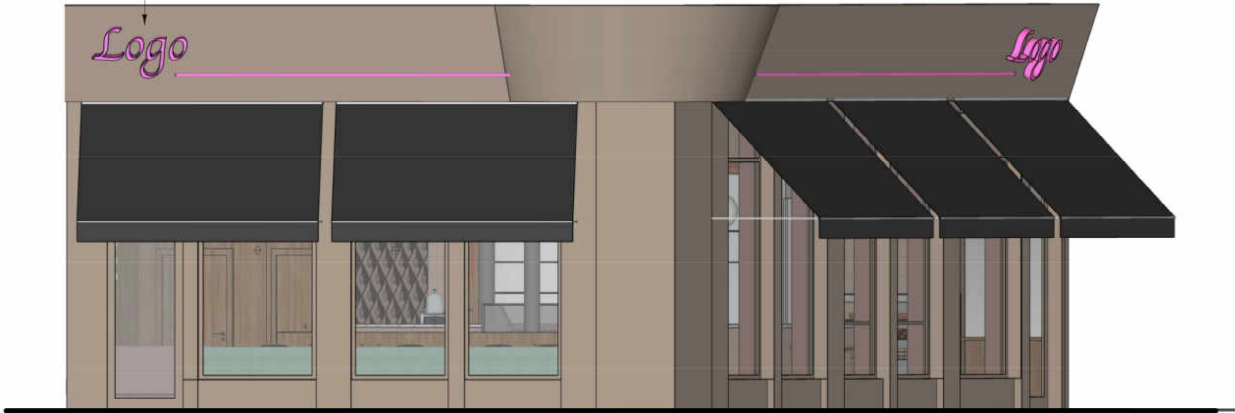
JOCELYN SQ ELEVATION - WITH AWNINGS 1:50