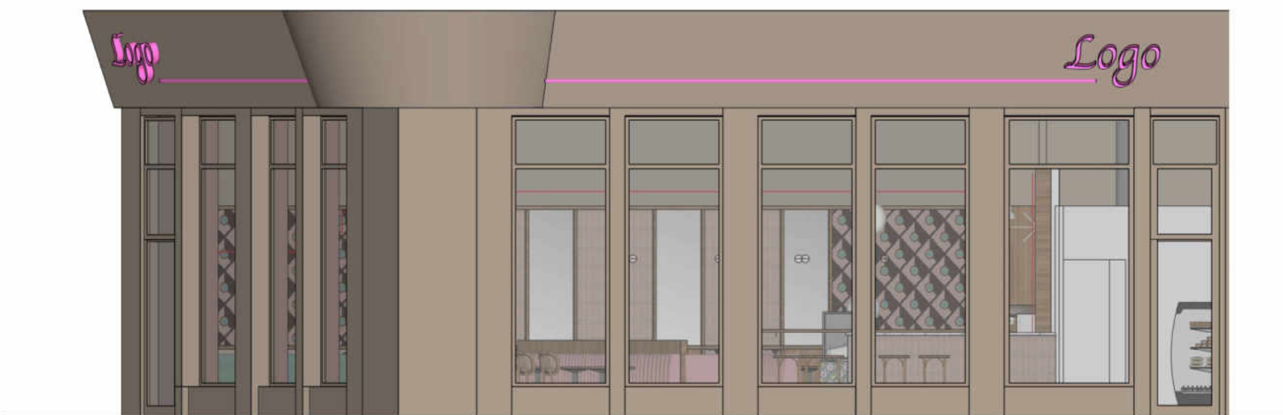
SALTMARKET ELEVATION - WITHOUT AWNINGS 1:50