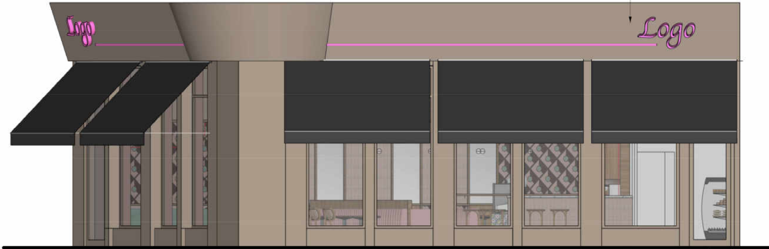
SALTMARKET ELEVATION - WITH AWNINGS 1:50

Neon company name (to be confirmed) with linear neon light beneath. Colour, pink (to be approved). Refer to drawings by signage company.