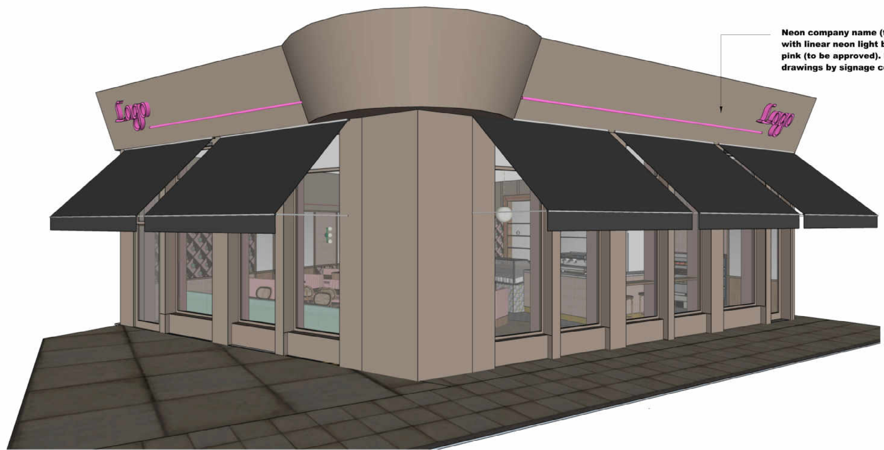
PROPOSED PERSPECTIVE NTS

Neon company name (to be confirmed) with linear neon light beneath. Colour, pink (to be approved). Refer to drawings by signage company.