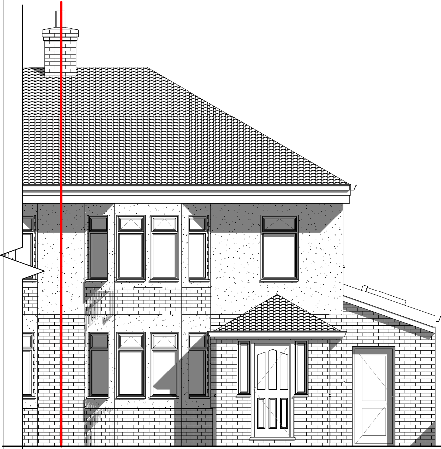
Front Elevation 1 : 50