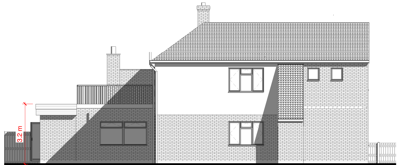
4 Proposed Side Elevation. 1 : 100