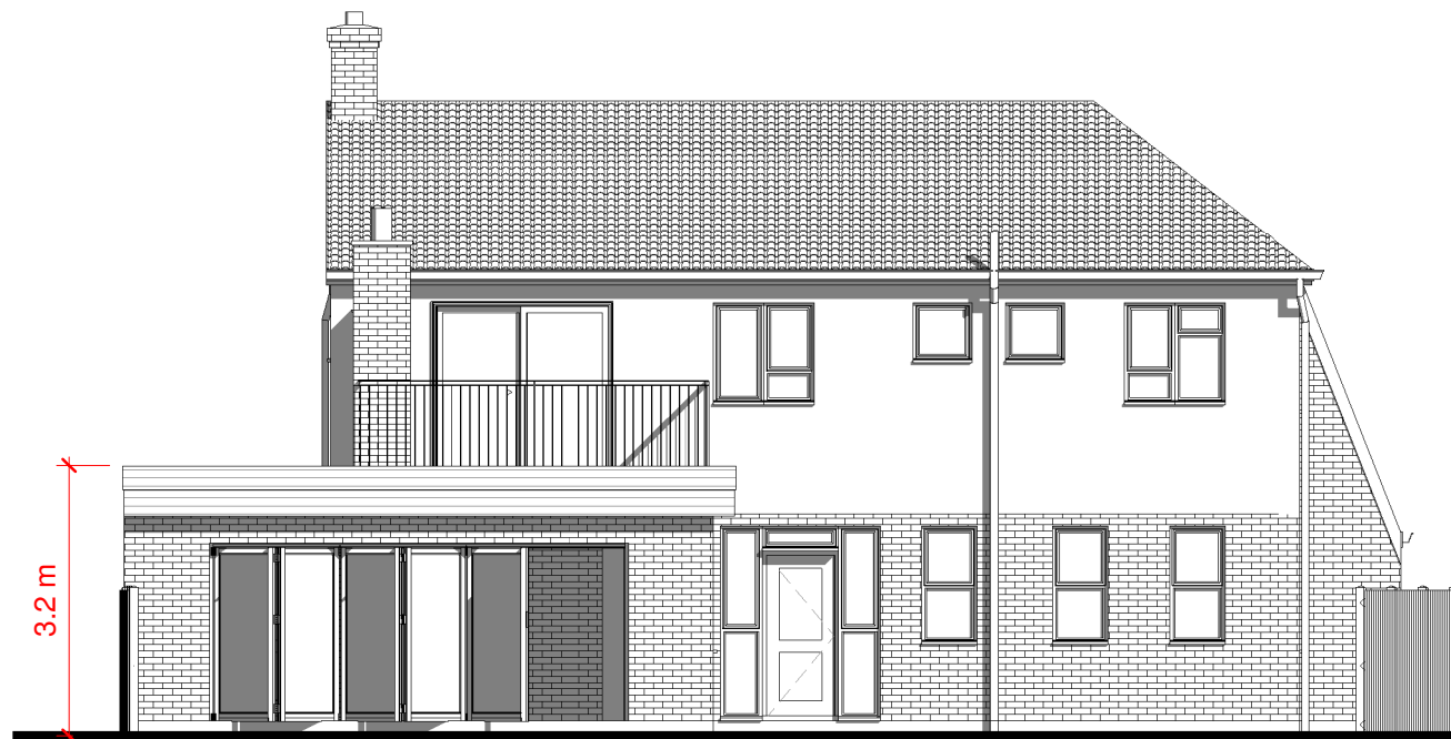
3 Proposed Rear Elevation. 1 : 100